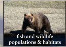
fish and wildlife populations & habitats