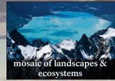
mosaic of landscapes & ecosystems