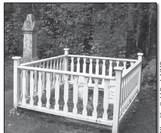
Klondike Gold Rush NHP

members of the Mathews family and other previous long-time residents of Dyea. Prior to 1979 these graves resided in the historic Town Cemetery in Dyea. During the 1970s, the Taiya River began washing the cemetery out as it is still doing today. To protect these graves, they were moved to this spot adjacent to the Slide Cemetery.