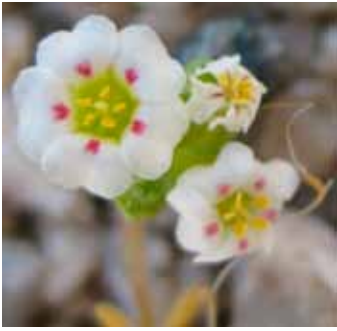
Linanthus maculatus , a diminutive annual with a flower no larger than five mm in diameter.

and Ayenia compacta were all found during the fall within the Eagle Mountains. In addition, several new populations of Aloysia wrightii were located. A large population of Astragalus tricarinatus , a federally endangered species, was located in the upper reaches of East Deception Canyon in spring. This was a significant find in that it represents an eastern range extension for the species, as well as the largest population within the park. We were able to relocate several populations of Linanthus maculatus , a diminutive annual in the Polemoniaceae family with a flower no larger than five mm in diameter. We also found two new areas with healthy populations. Another interesting find occurred in the Wonderland of Rocks, east of Willow Hole, where a unique oak hybrid was found, Quercus x munzii . The only other known individual of this hybrid occurs at Live Oak picnic area.