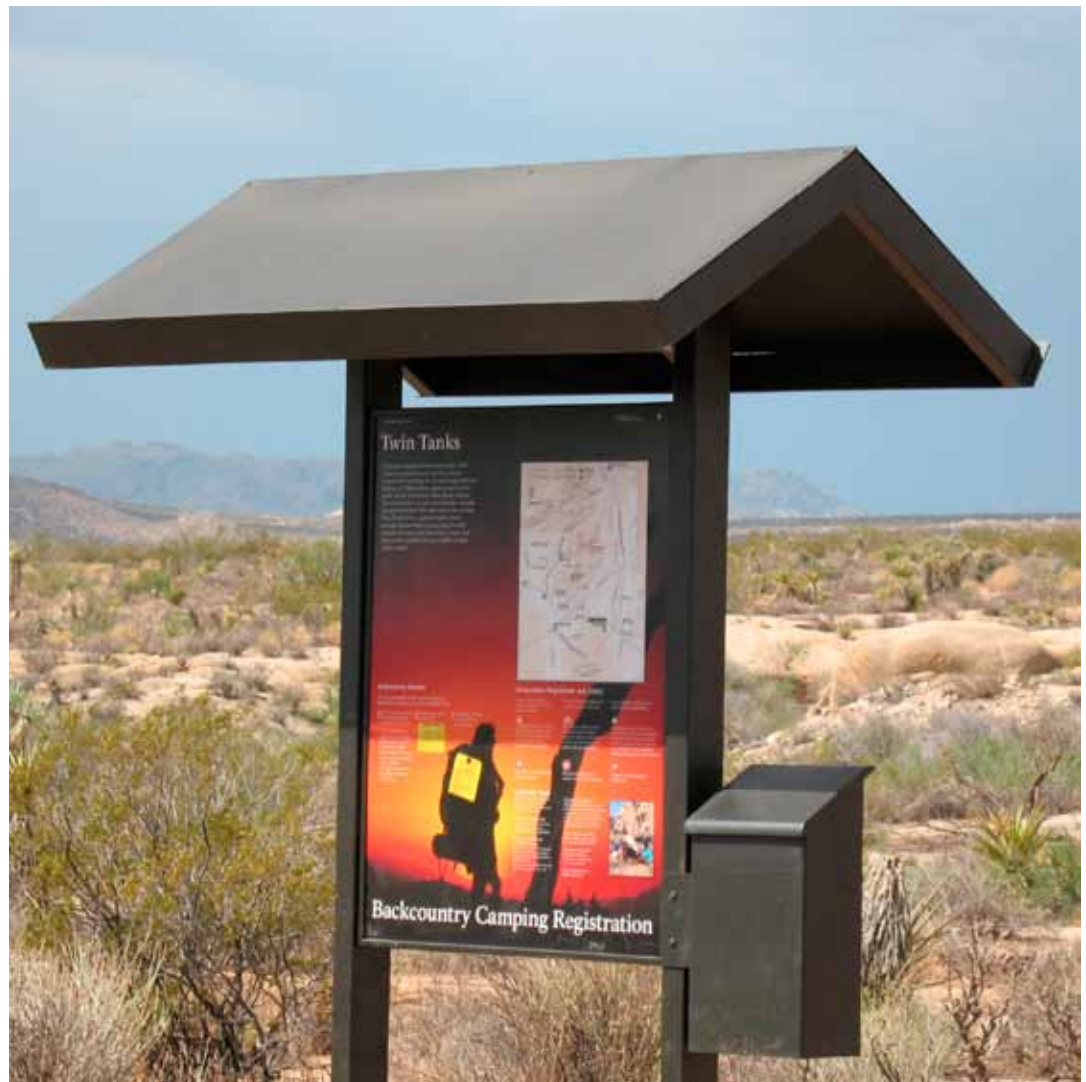
New backcountry registration board at Twin Tanks.

Eight-hundred and fifty-two students went