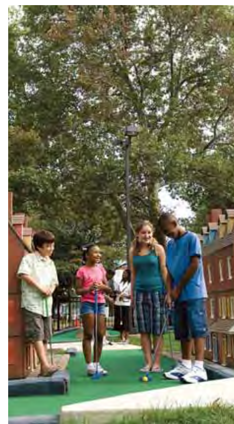
Philly Mini Golf (J. Holder)

Philly Mini Golf , Center City's only miniature golf course! The course allows you to putt through famous Philadelphia attractions such as the Liberty Bell and the Art Museum . Additionally, there are two extraordinary playgrounds for kids of all ages, as well as seated and shaded areas for parents to relax and enjoy watching their children run and play. Whether you just want to lounge outside or you're ready for a day full of activities Franklin Square is the place for you!