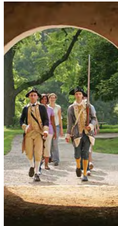
Valley Forge After Hours

For tickets, call (215) 629-4026 or go to www.historicphiladelphia.org