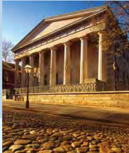
Second Bank of the U.S.

Visit the new Faces of Independence exhibit with life portraits of the founders such as Martha and George Washington, and Dolly Madison. Children use Hidden History maps to find famous people. Discover Moses Williams, an African American who earned his freedom and a living by cutting profiles in Peale's Museum. Wed. - Sun. 10 a.m.-5 p.m.