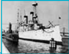
USS Becuna (left) USS Olympia (right)