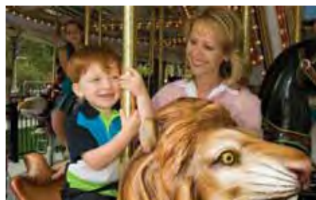
Franklin Square Carousel

H istoric Philadelphia offers more than cultural experiences and education. It's fun for people of all ages! Franklin Square , voted as 2007's Best Play Space for Kids , is a place where everyone can go to have fun in the sun! Enjoy the beautiful May weather while enjoying ice cream, hamburgers, hot dogs, soft pretzels, and other refreshments. Sit and enjoy a picnic by the beautiful fountain, or take a ride on the Philadelphia Park Liberty