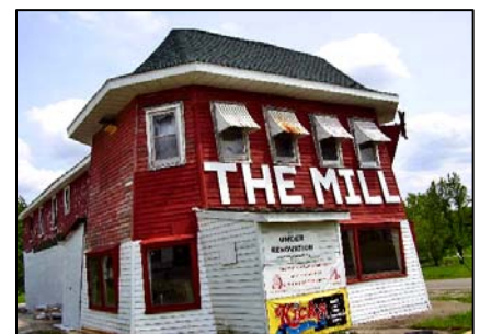
Grants awarded in FY2008 include the restoration of the Highway Café, Winslow, Arizona (top); the Donut Drive-In sign, St. Louis, Missouri (middle); The Mill café, Lincoln, Illinois; and others.