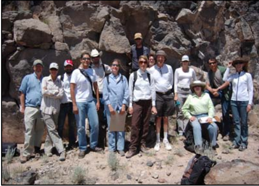
Top: NPS worked with the National Trust for Historic Preservation and the Historic Route 66 Association of Arizona to fund an emergency conditions assessments report for the Twin Arrows Trading Post outside of Flagstaff, Arizona.