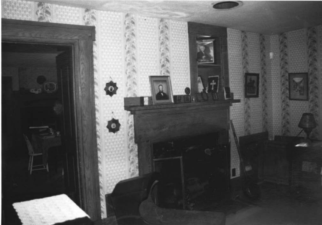
LEAVITT, JAMES, HOUSE; YORK CO., ME