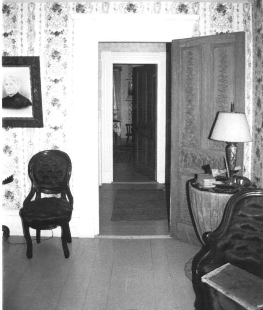
LEAVITT, JAMES, HOUSE; YORK CO., ME