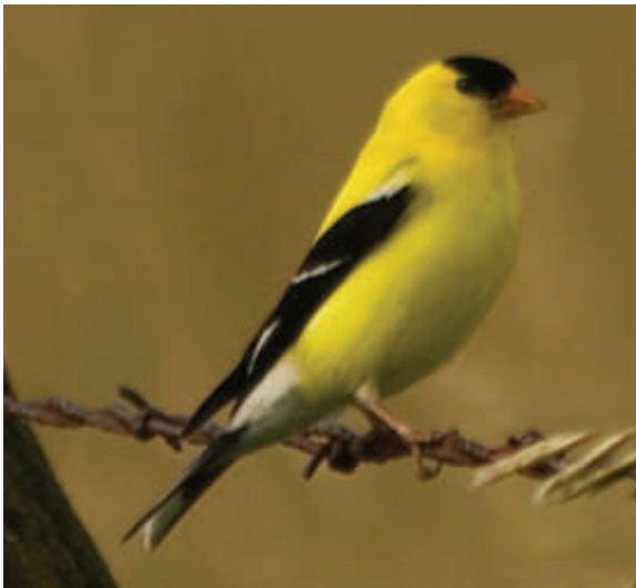
An American goldfinch perches on the park's boundary fence.

Volunteers survey breeding birds at Herbert Hoover National Historic Site using established scientific protocol. The findings supplement inventory and monitoring data collected by National Park Service biologists. Studying long-term changes in bird populations helps park managers evaluate prairie restoration efforts, the effectiveness of management methods (such as prescribed fire), and the quality of habitat the park provides.