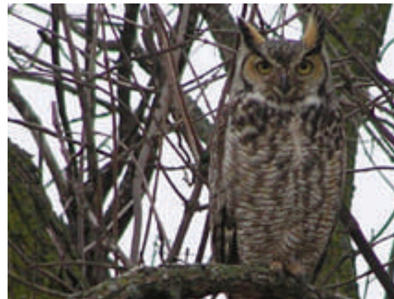
A great horned owl is well-camouflaged in a tree.

Herbert Hoover National Historic Site www.nps.gov/heho