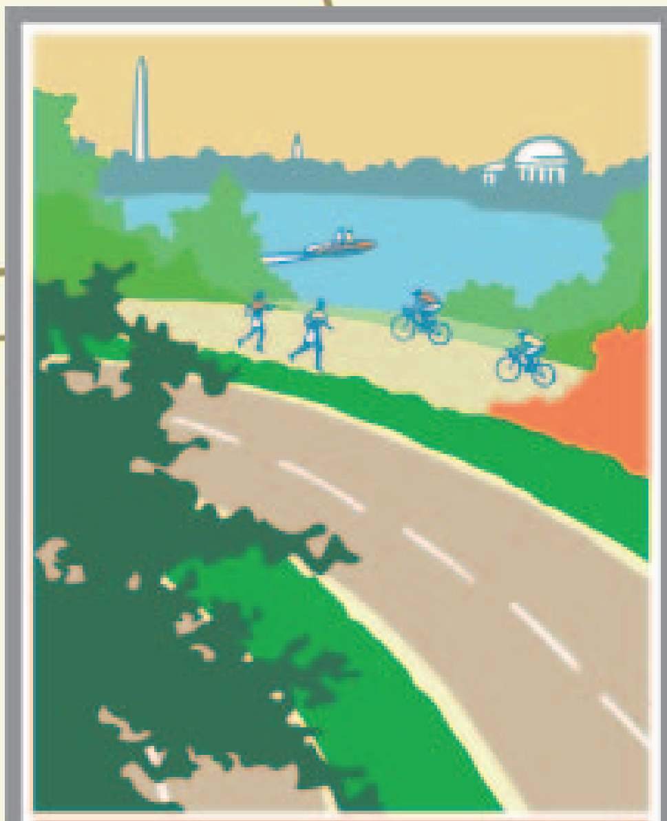
GEORGE WASHINGTON MEMORIAL PARKWAY

The Mount Vernon Trail, along the shoreline of the Potomac River, is a paved, multi-use trail for walkers, bicyclists, and runners offering over eighteen miles of breathtaking scenic vistas from Rosslyn to Mount Vernon in Virginia. Many local residents use the Mount Vernon Trail as a daily commuter route and it's multiple trail connections in Virginia, District of Columbia, and Maryland.