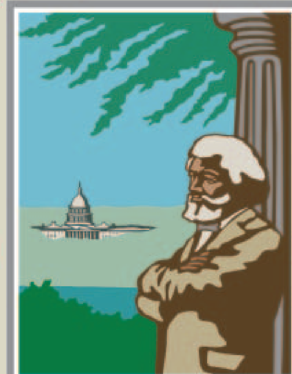
FREDERICK DOUGLASS NATIONAL HISTORIC SITE

National Mall and Memorial Parks are traversed by thousands of visitors and recreational users alike by the use of sixteen miles of multi-use trails. Visitors can enjoy the elm tree-lined trails along the Lincoln Reflecting Pool, the cherry tree-lined trail around the Tidal Basin, and along Pennsylvania Avenue "America's Main Street."