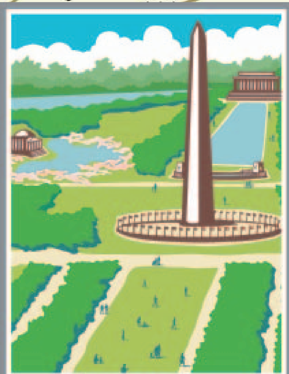
NATIONAL MALL & MEMORIAL PARKS

The Mount Vernon Trail, along the shoreline of the Potomac River, is a paved, multi-use trail for walkers, bicyclists, and runners offering over eighteen miles of breathtaking scenic vistas from Rosslyn to Mount Vernon in Virginia. Many local residents use the Mount Vernon Trail as a daily commuter route and it's multiple trail connections in Virginia, District of Columbia, and Maryland.