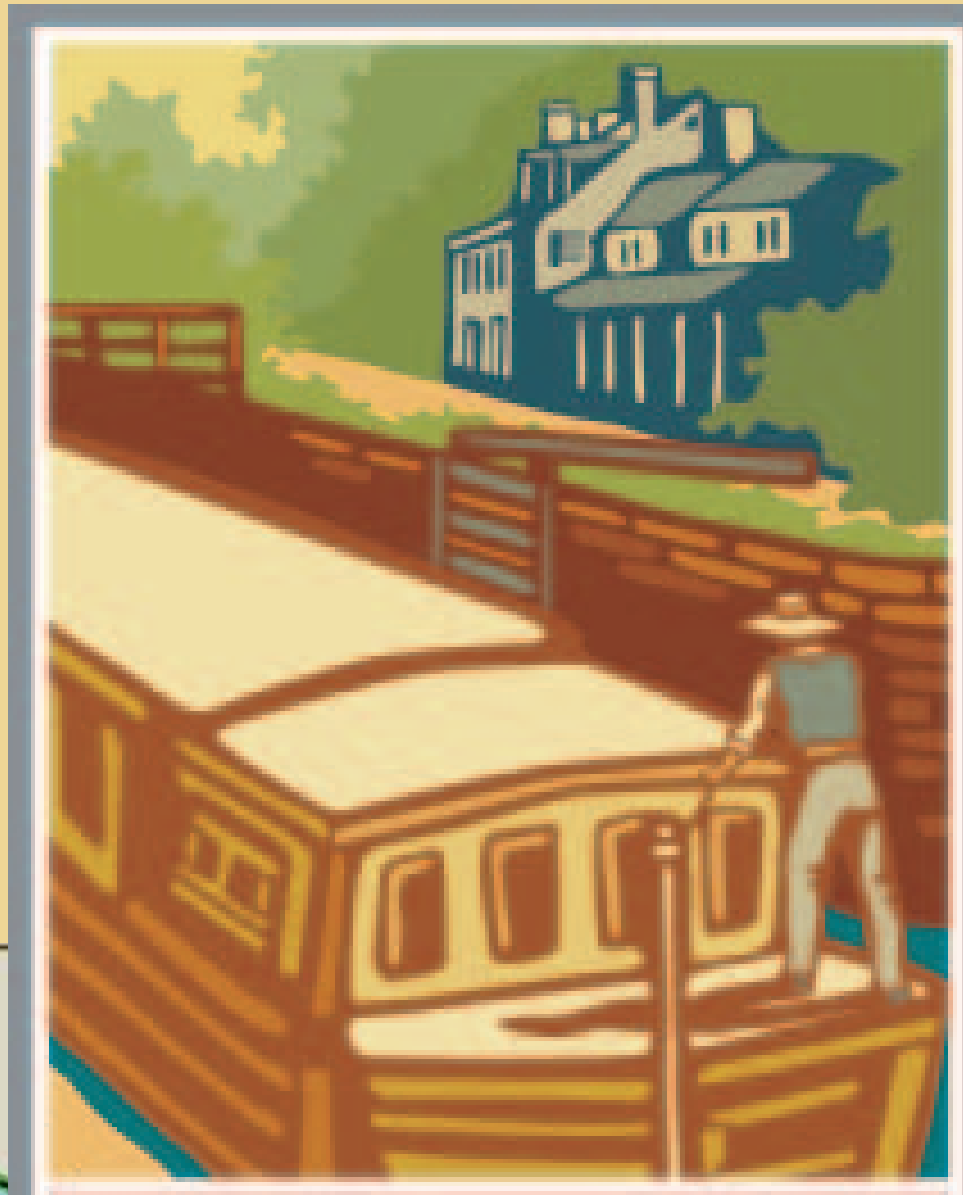
CHESAPEAKE & OHIO CANAL NATIONAL HISTORICAL PARK

Stretching 184.5 miles from Georgetown to Cumberland, Maryland, the C&O Canal towpath was built to enable mules to pull cargo to the ports of Georgetown and Alexandria. Today the towpath serves a very different role, as a "long stretch of quiet and peace at the capital's back door," on which thousands of visitors walk, run, bike, or just soak in the nature and history of the old canal.