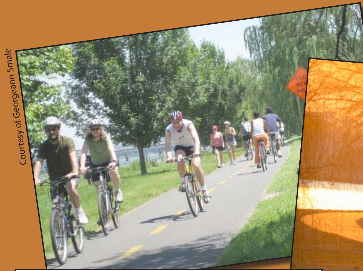
Diversity along the Mount Vernon Trail, busy weekend usage to a calm morning.