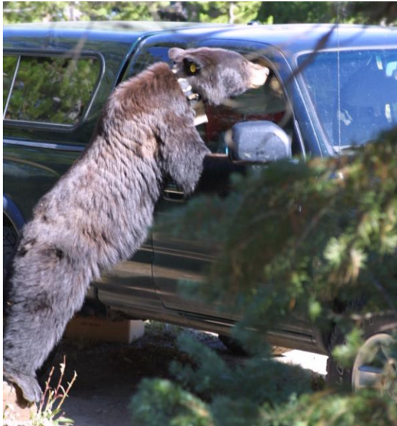
Black bear #22073 sniffing food items through a small opening in car window. (Park visitor Photo).

Black bear #22057, a 4-5 year old female, had a history of frequenting the Colter Bay campground since 2006. In 2007, she received multiple food rewards and was becoming more and more aggressive. On August 29, 2007 #22057 received a substantial food reward (donuts, snicker bars, bread, potato chips) from the hiker-biker loop in the Colter Bay campground and according to rangers was extremely aggressive. Initially a culvert trap was set in a closed loop of the Colter Bay campground with no success. Bear #22057 was eventually free-range darted in the closed loop and euthanized on August 29, 2007.