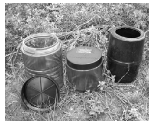
The three types of bear resistant food canisters provided by Grand Teton National Park Summer 2010

Black and grizzly bears live in the park and parkway. Follow these guidelines to make your hike and camp safer. They are for your protection and for the preservation of the bears, a true sign of wilderness.