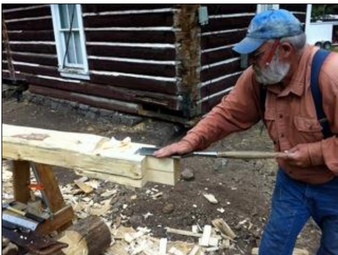
The crew shaped the replacement log-ends to match the existing square notching.