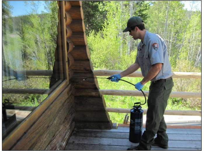
The lodge was cleaned prior to restaining.

Preservation maintenance on the Brinkerhoff Lodge in Grand Teton National Park is ongoing. In 2011, WCHP replaced deteriorated log-ends on the Lodge, and cleaned and restained the Lodge and Caretaker's Cabin. In addition, the WCHP crews patched and replaced damaged siding, and refinished and refit several doors. They also replaced damaged porch joists.