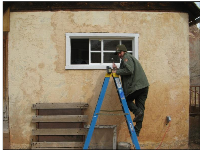
Repaired windows were reinstalled, and the jambs were scraped and repainted.

In 2010 and 2011 the WCHP crew traveled to Capital Reef National Park to work on the historic Dewey Gifford House. In Phase I, the WCHP repaired the roof and removed the windows for repair in the WCHP shop in Moose, WY. In phase II, the crew scraped and sanded the window jambs, reinstalled the repaired windows, and repaired the exterior stucco.