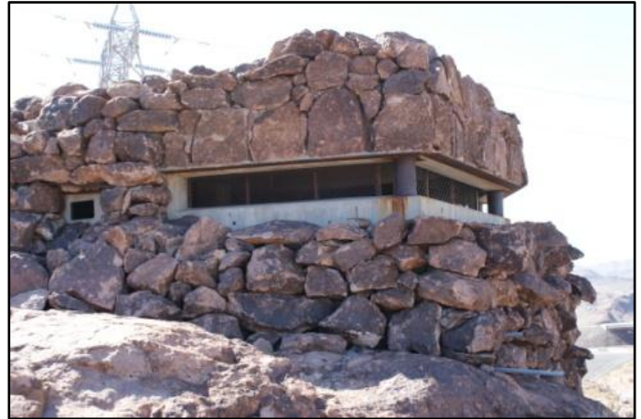
The bunker overlooks Hoover Dam. Preservation work will begin in 2012.

The Hoover Dam World War II Bunker project is a multi-year project to restore the stone bunker above Hoover Dam. Phase I and II, completed in 2010 and 2011 respectively, included initial site visits and the composition of a Historic Structures Report. Completed in partnership with the NPS Intermountain Regional Office, the HSR will guide preservation work planned for 2012.