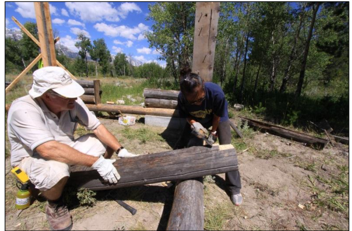
Michigan volunteers shape logs at the Bar BC Dude Ranch.