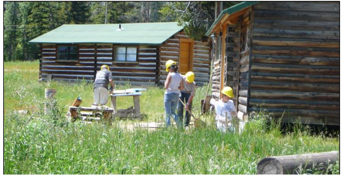
Becket Chimney Corners YMCA campers work at White Grass Dude Ranch.