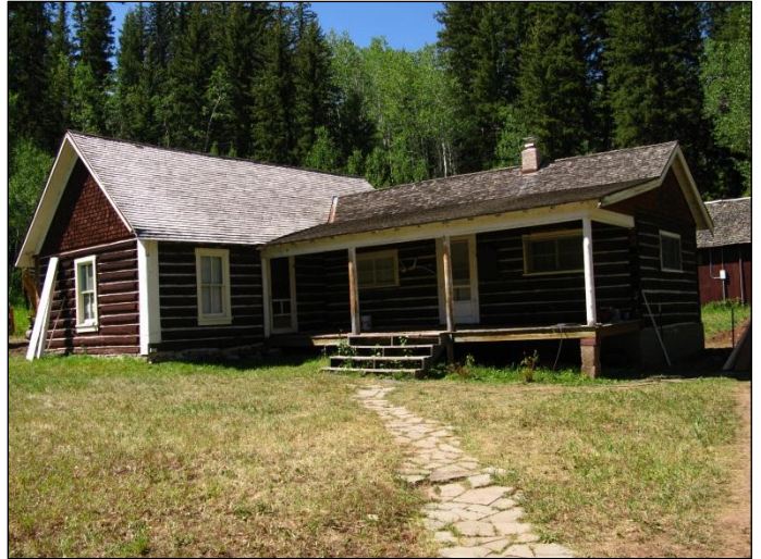
The Bryan Flats Guard Station is one of the oldest guard stations on the forest.

During the summer of 2011, a crew from WCHP traveled south to the Bryan Flats Guard Station, one of the oldest remaining guard stations on the forest. The WCHP corrected structural deficiencies in the foundation, and replaced deteriorated logs. In 2012, the WCHP will return to the site to complete chinking on the exterior of the cabin.