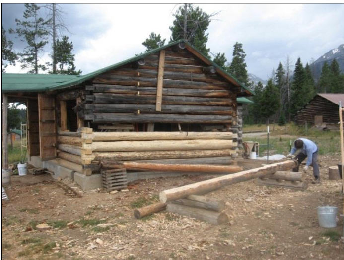
Log are replaced at cabin 1158.

During the summer of 2011, work focused on three sleeping cabins: cabins 1157, 1158, and 1160. In 2010, new foundations were poured for these cabins. During the summer of 2011, floors, plumbing, and the front deck were completed on 1157,