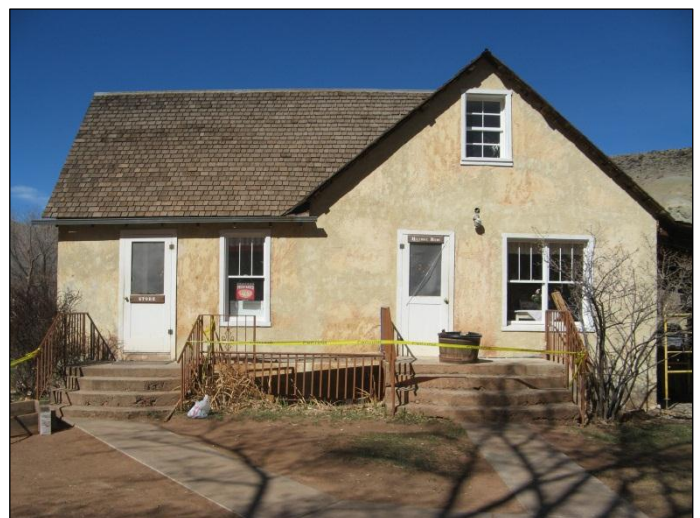
The Dewey Gifford House as seen after the WCHP crew completed preservation work.