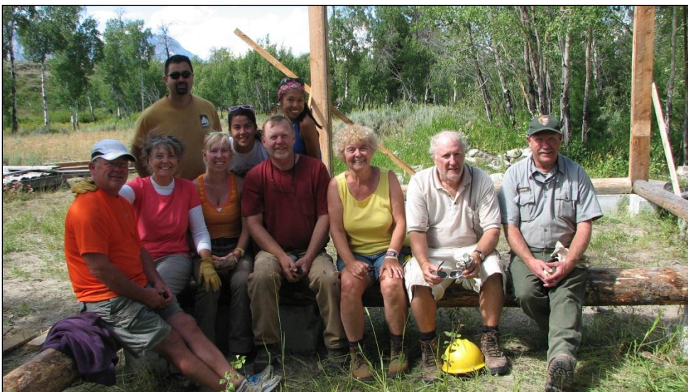
Left: The Michigan Volunteers take a break for a photo.