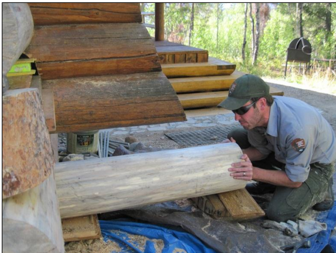
Deteriorated log ends were replaced in-kind.