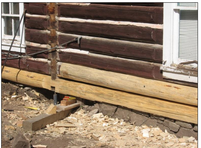
Several sill logs were replaced, then repainted to match the existing colors.