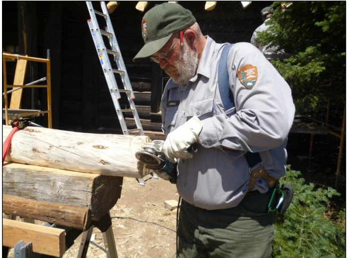
The rafter tails were replaced with Dutchman repairs, which required new logs to be shaped and inserted in place of the deteriorated logs.

At Beaver Creek #10 the WCHP crew stabilized the building, focusing their attention on exterior deficiencies to prevent further deterioration. The WCHP replaced and repaired deteriorated sill logs, log crowns, purlin ends, roof joists, and sections of damaged board and batten siding. They also repaired chinking with a historic mortar mix, and performed several miscellaneous tasks to better seal the building from pests.