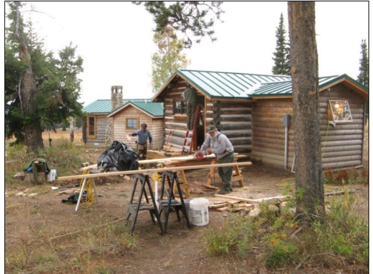
The WCHP crew finishing the exterior work on cabin 1157.

and windows, roofs, and all exterior work was completed for 1158 and 1160. During the fall and winter, interior work was completed, allowing all three cabins to be opened to trainees and volunteers next summer. In addition, the ADA ramp on cabin 1155 was completed. Both 1155 and the Hammond Cabin are now fully accessible structures.