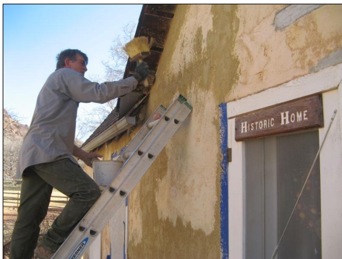
The exterior stucco was repaired.