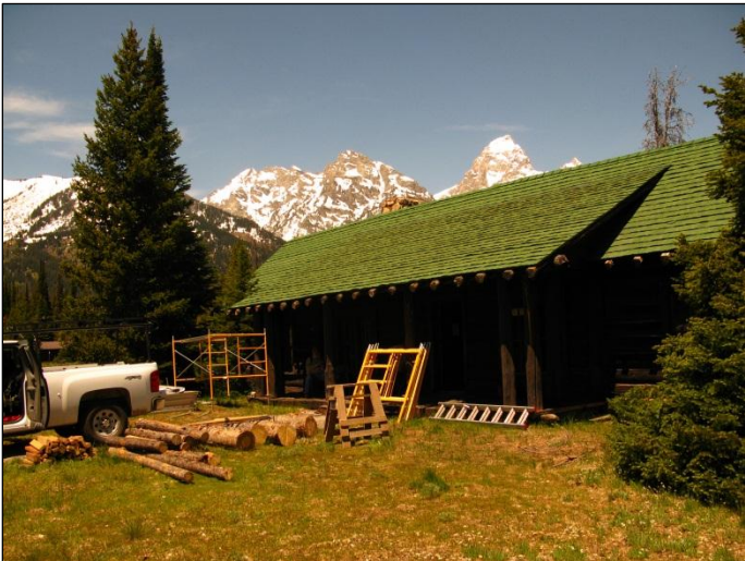
The Beaver Creek historic district is located in Grand Teton National Park at the base of the Teton Mountains.