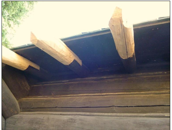
Rafter tails prior to painting.