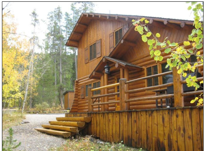
The Brinkerhoff Lodge after the WCHP crew completed preservation work.