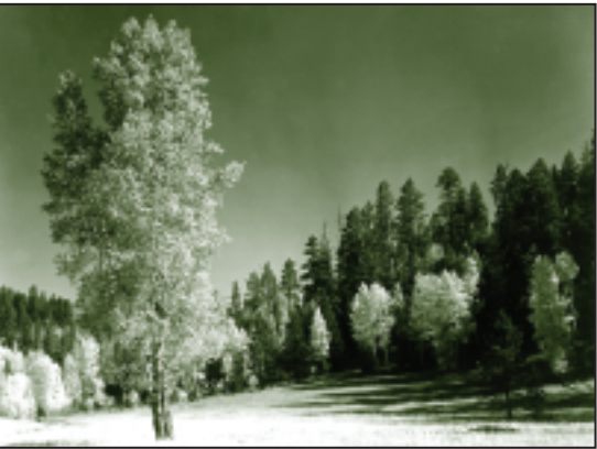
Photo Above: Aspen and ponderosa forest provides habitat for a variety of North Rim wildlife.

Through a complex process of aeration, bacterial digestion, settling, and filtration, a non-toxic sludge and reclaimed water are produced. The sludge is transported to a landfill outside the park; the reclaimed water is used for many things, including watering the lawn at the lodge and fighting fires. Excess reclaimed water is returned to Bright Angel Creek via The Transept. The process is a costly one—both financially and to the environment, for it requires energy—but allows the North Rim to host upwards of a half million visitors each year.