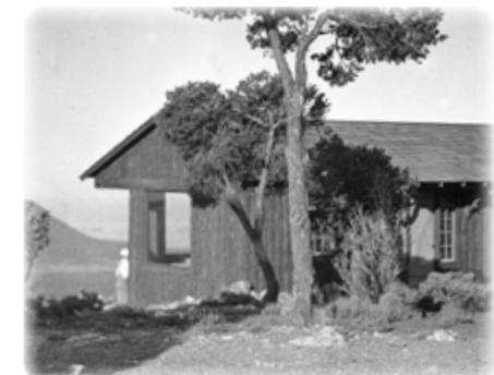
Caretaker's Cabin in original location

On the right farther along the path, the house with two chimneys (2) ( below ) is the oldest building at Desert View. Originally constructed near the rim in 1927, it served as a place for visitors to rest, eat, and view the canyon. Following the construction of the Watchtower, it was moved to its current location and functioned as the caretaker's cabin. It retains some of its original glass and exterior siding and stone work. Imagine all of today's visitors trying to enter this building for tea!