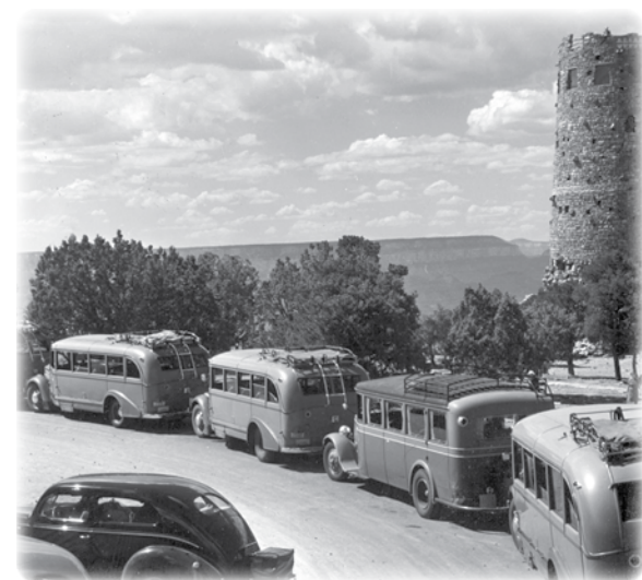
Fred Harvey buses at Desert View circa 1938