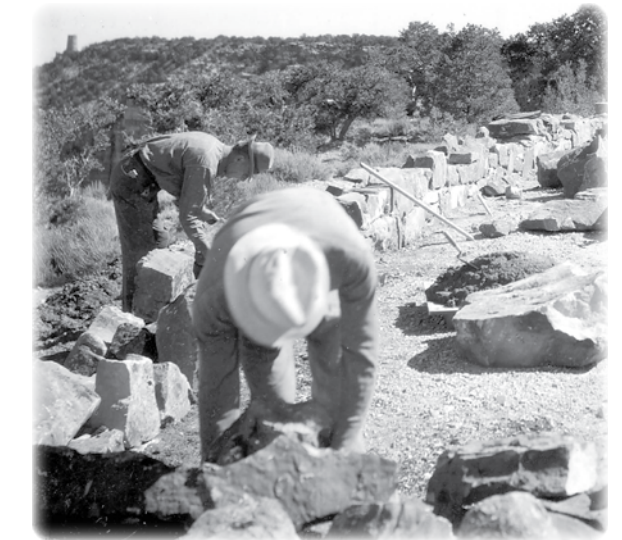
CCC "boys" at Navajo Point; note the Watchtower on the horizon

As you walk the path curving to the right, reflect back to the men of the Civilian Conservation Corps (CCC) who lived and worked at Grand Canyon from 1935 to 1942. While living in barracks, they completed more than twenty projects at Desert View including trails, rock walls ( below ), roads, and buildings. CCC crews built the stone-walled building (3) in 1941 as a restroom. The crews' attention to detail shows the pride they had in their accomplishments.