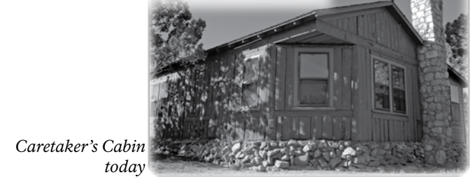
Caretaker's Cabin today