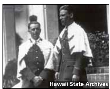
Islanders honored "Bird of Paradise" pilots with feather capes reserved for Hawaiian royalty.

After the around-the-world flight, which made short hops between the northern continents, the nation engaged the next big challenge— long distance flight crossing entire oceans. In August of 1925, Navy Commander John Rodgers led two seaplanes down the ramp into the bay at Crissy Field to meet that challenge. After crossing six miles of the bay at full throttle, the PN-9 planes finally became airborne and sped west towards Hawaii at 115 miles per hour.