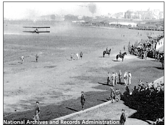
Crowds of thousands greet around-theworld fliers at Crissy Field.

September 28th, the Chicago and New Orleans had covered 26,345 miles in 172 days.