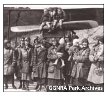
Pilots took their families up to prove that aircraft were safe.

Have you ever been scared during an airplane flight? Most of us have at one time or another, even in today's very safe aircraft. However, during the pioneering days of flight, every trip was death-defying and possibly one's last.