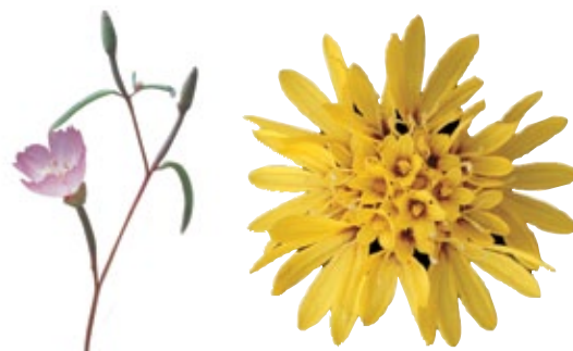
Presidio clarkia (left) lives only on serpentine soils and San Francisco lessingia (right) requires dunes.

to the surface along faults. Though serpentine soils are poor in nutrients and high in toxic metals, the endangered Presidio clarkia and Raven's manzanita, among others, have adapted and thrive. Sand dunes that are dry, nutrient poor, and ever-shifting with the wind are home to rare species such as the San Francisco lessingia and dune gilia that have adapted to survive in these conditions.