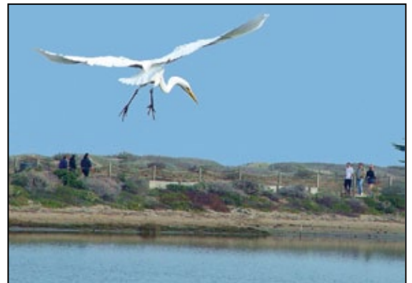
The Presidio provides sanctuary to both nature and urban dwellers.

The wildlife and native plant communities at home in the Presidio today are testament to the resilience of the natural world—evidence that there is a place for nature in cities. Wildflowers bloom almost year-round. Oak woodlands, where Ohlone peoples collected acorns, continue to bear fruit each fall. To experience the Presidio's living natural history yourself, take a stroll through moody, fog-drenched woodlands, careful not to step on banana slugs hiding in the leaf litter. Or walk barefoot on Baker Beach and feel the sand shift beneath you. A red-tailed hawk soars above as a lizard darts away from your approach. In these moments it is not difficult to imagine the Presidio as it once was.