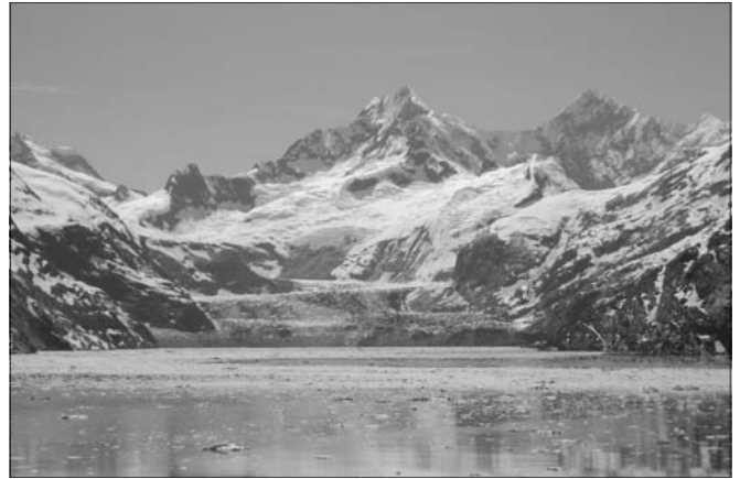
Johns Hopkins Glacier

For thousands of years, Tlingit (pronounced klink-it ) Indians and their ancestors have lived in or near what is now Glacier Bay National Park. Animals and plants from the forest and sea provided food, shelter and clothing, and the abundance of the land gave these people the spare time to develop a rich and diverse culture. Near the end of the Little Ice Age (about 400 years ago,) advancing glaciers forced one group of Tlingits to abandon their village that was located in what is now the lower part of Glacier Bay.