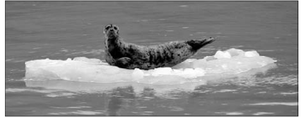
Harbor seal on iceberg

The park features include mountains over 15,000 feet high, beaches with protected coves, deep fjords, tidewater glaciers ( glaciers that flow down to the sea ), coastal forests, meadows, estuaries ( mixed salt and fresh waters ), lakes and rivers. These natural resources provide ideal habitats for animals. Land and marine mammals, birds and intertidal life all depend on the park's healthy ecosystems for survival. Glacier Bay is an ideal laboratory to study and observe these natural resources.