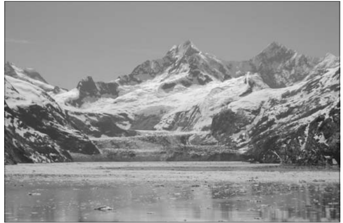
Johns Hopkins Glacier

For thousands of years, Tlingit (pronounced klink-it ) Indians and their ancestors have lived in or near what is now Glacier Bay National Park. Animals and plants from the forest and sea provided food, shelter and clothing, and the abundance of the land gave these people the spare time to develop a rich and diverse culture. Near the end of the Little Ice Age (about 400 years ago,) advancing glaciers forced one group of Tlingits to abandon their village that was located in what is now the lower part of Glacier Bay.