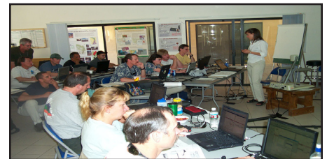
Geospatial training class