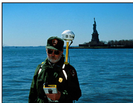
Ellis Island mapping with GPS

Of all the departments within the Federal government, DOI is arguably the one most closely tied to the land. DOI is chartered with managing and protecting the Nation's resources [2], which are geographic in nature (for example, National Parks, Mineral Resources, and Lands Management). Most of the services provided by DOI program and mission areas are associated with a specific location or geographic area. Tracking, providing, and improving the delivery of these services to the public and partners require that information about such locations be collected and managed by the various bureaus. Multiple DOI programs often