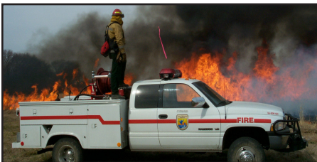
Burning at Eastern Virginia Rivers National Wildlife Refuge