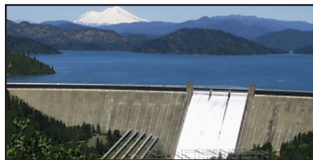
Shasta Dam, Shasta, California