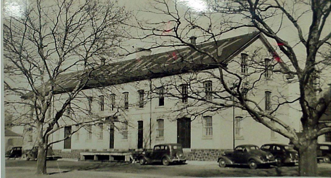
Quartermaster Building 32 pictured in 1940.

Images in interview are courtesy of NPS/Gateway NRA