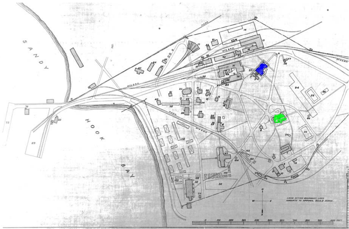
Map of Sandy Hook Proving Ground from 1908. At far left are the docks where the current U.S. Coast Guard is located. Both roads and railroad tracks are visible on map. Tracks go from docks, eastward to the roundhouse and past the warehouses. Highlighted in blue is the Administration Building of the Proving Ground which is no longer standing. Highlighted in Green is the Officers' Club, Building 114 which was known as the "brick house." It served as housing for the officers of the Sandy Hook Proving Ground.