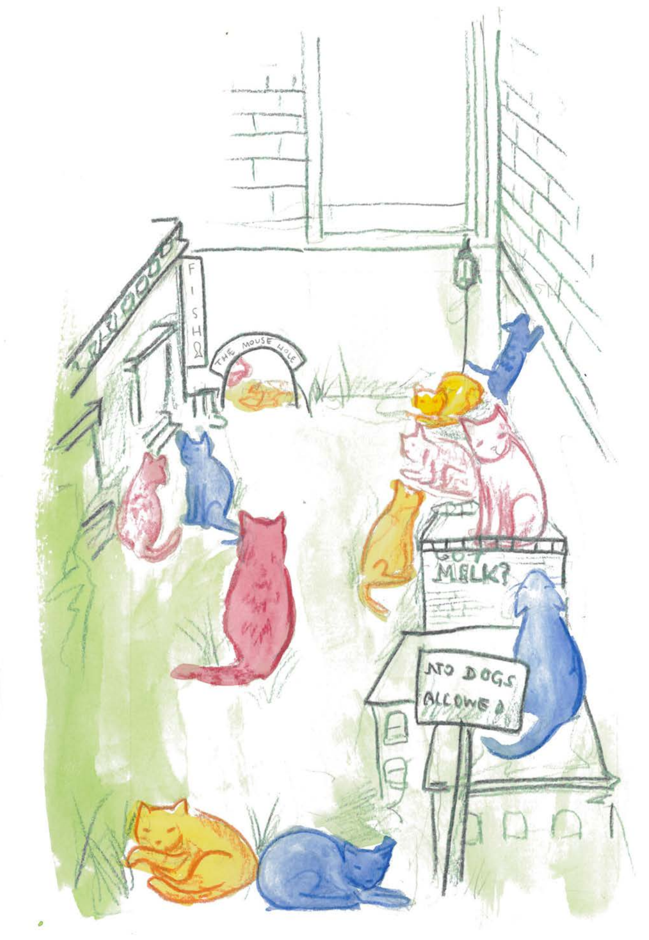
and in a month, 180