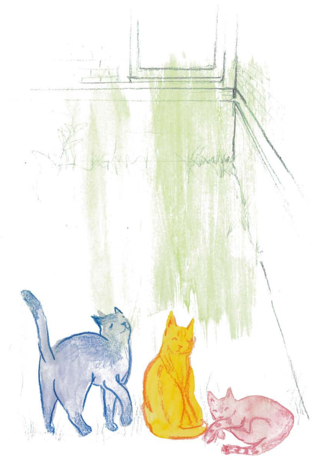
If I should send Quiz to you to keep the cows away from your rhubarb,

he would not be here to drive the cats out of the yard.