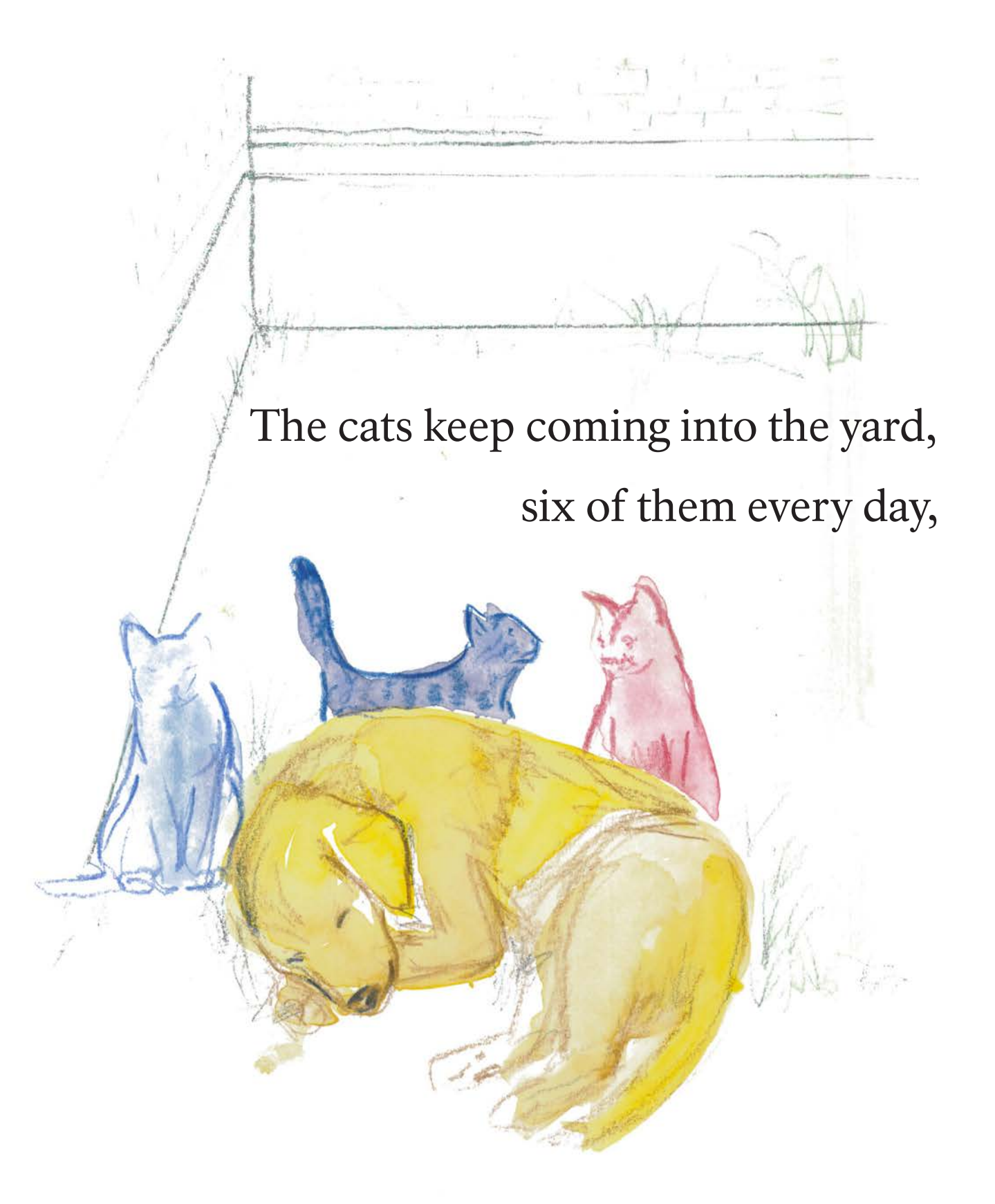
and Quiz drives them out.