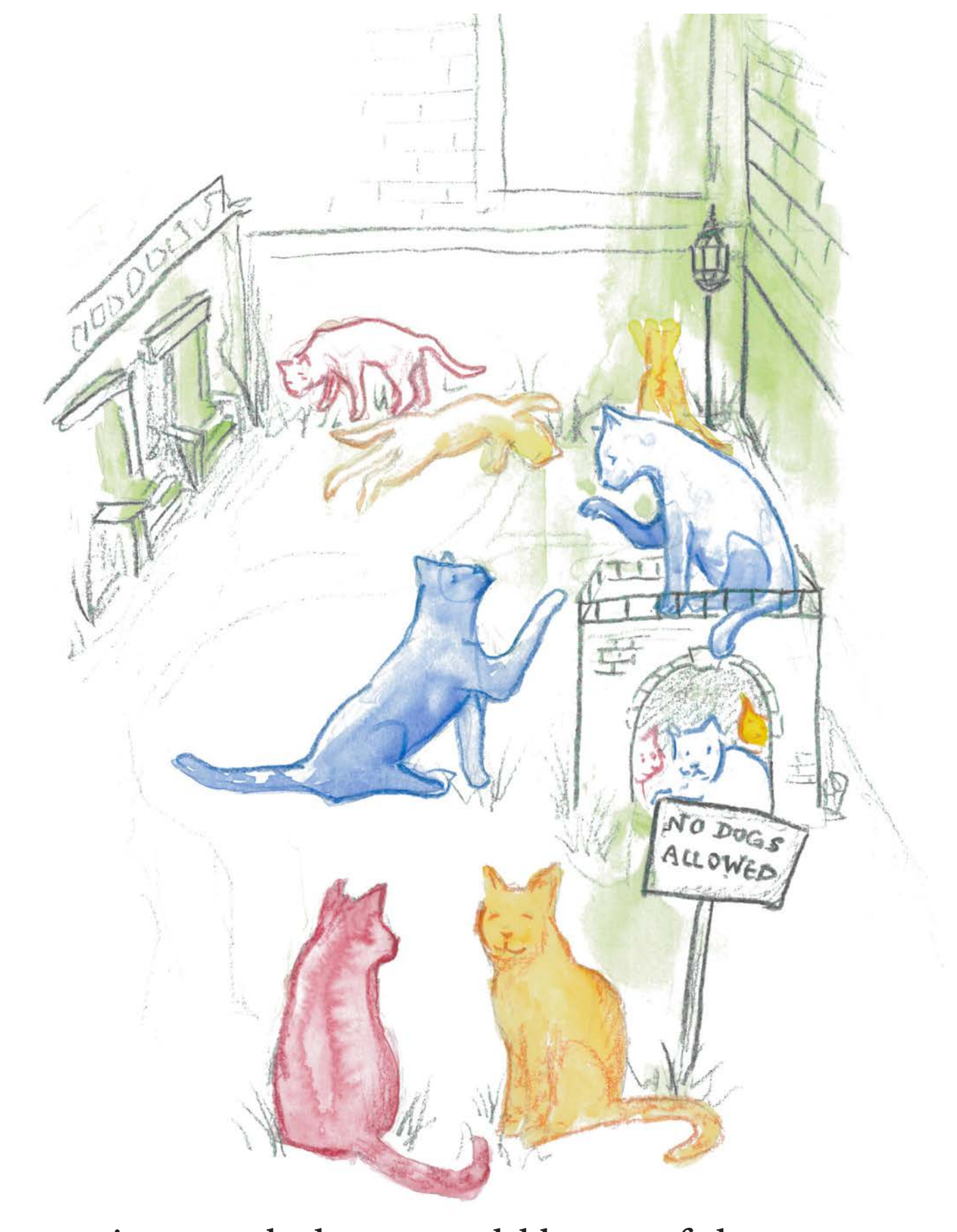
in a week there would be 42 of them