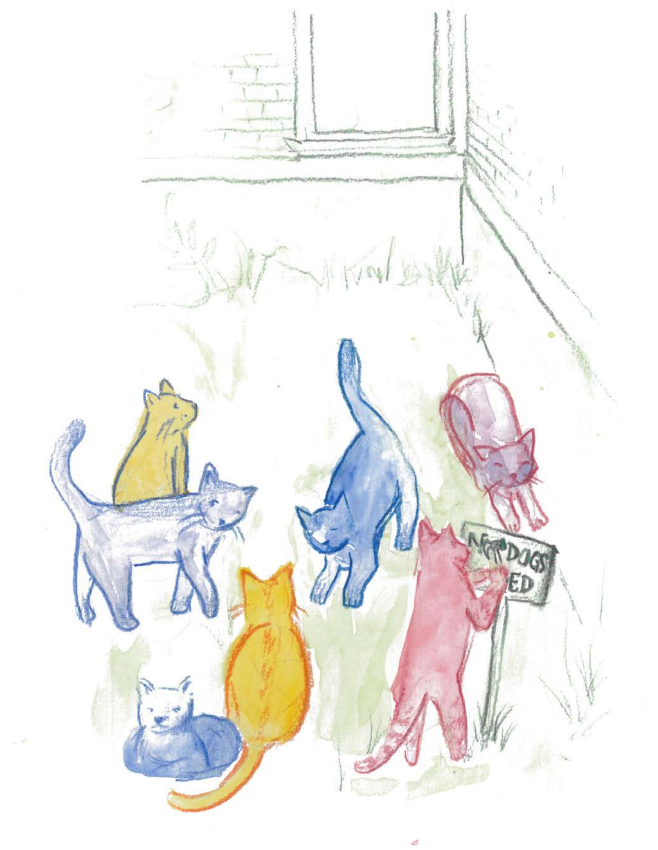
If six cats should keep coming into the yard every day and not go out,