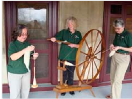
Volunteers demonstrate the use of a spinning wheel at Friendship Hill.

Over the winter, volunteers have been training to become proficient in such crafts as wool spinning, knitting, embroidery, quilting, constructing hand-stitched period clothing, and basket making to prepare for the demonstrations to be presented this coming summer. They will study additional crafts such as dutch oven cooking, soap making, musket firing, flint knapping, and fire starting with flint and steel. "Our goal with these new programs," said volunteer Elsie Ahlgren, "is to create something that we can enjoy demonstrating and draw the