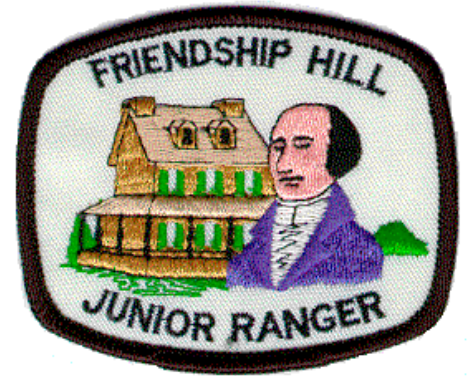
Friendship Hill Junior Ranger Patch.

Children 6-12 can earn a patch by completing these activities designed for young minds.