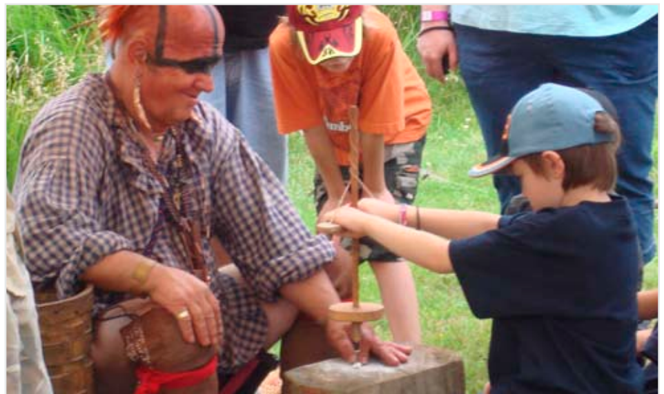
Albert Gallatin's interest in American Indian culture led him to create the American Ethnological Society. Interest in native lifeways continues today..

Re-enactors of various backgrounds, including Seneca, Shawnee, Abenaki, Oneida, Huron, and Cherokee will demonstrate American Indian lifeways to visitors, who will be allowed to participate and try some of the traditional skills themselves. Historic lifeways demonstrations include, fire starting, Indian games, tanning, cooking, bone jewelry, arrow making, quilling, finger weaving, drumming, native plant usages, cord making, lacrosse, interpreting pictographs, tattooing and use of historic weapons