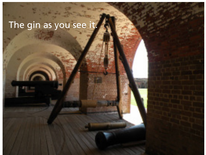
The gin as you see it.

Answer: Soldiers used them as steps to climb to the top of the gin.