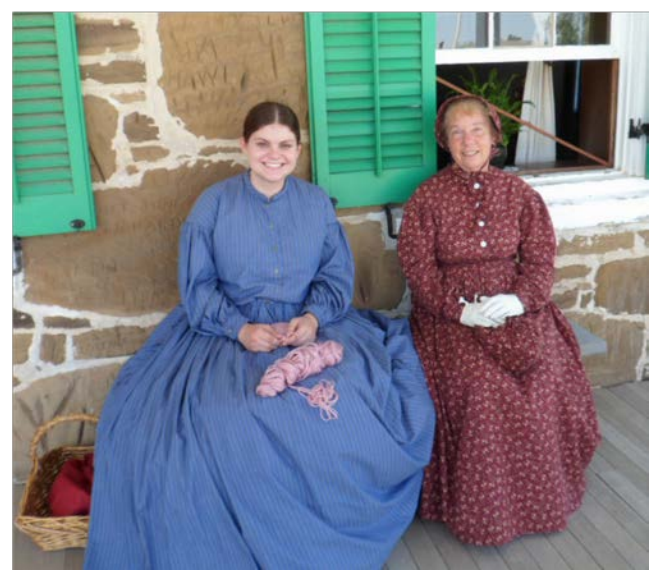
the Park Service VIP program.

People under the age of 18 years old may be VIPs provided they have the written consent of their parent or guardian.