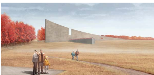
The Western Overlook. Paul Murdoch Architects

The Western Overlook , at the edge of the Field of Honor, overlooks the crash site. Visitors will be able to see where the investigation efforts were centered and where the families and the nation first viewed the crash site.