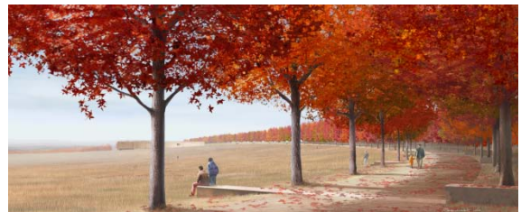
The Allée and Memorial Groves.

Encircling the Field of Honor will be a tree-lined walkway, or Allée , built on a raised earth form, at the same time as the Portal Walls and the permanent Visitor Center. The Allée will be flanked by 40 Memorial Groves of trees.