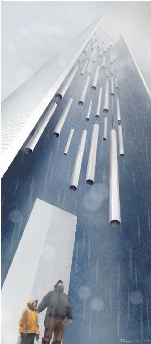
Tower of Voices . Paul Murdoch Architects

A 93-foot Tower of Voices will be built in the future. The Tower will serve as a landmark from the highway, marking the gateway to the park. Set among rings of trees, the Tower is planned to house 40 wind chimes that will serve as an enduring echo of the voices of the passengers and crew.