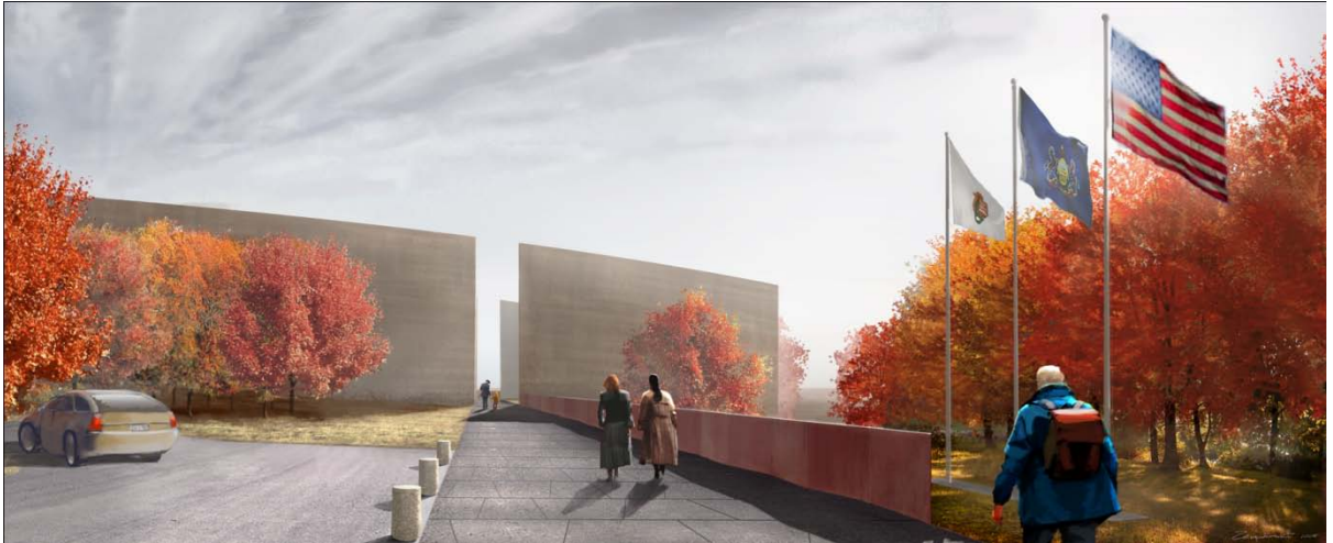
The Entry Portal. Paul Murdoch Architects

Large memorial walls will frame the sky where Flight 93 once flew. The height of the walls will approximate the altitude of the plane (40-50 feet) as it passed overhead. Visitors will pass through the Entry Portal for their first view of the crash site and the open expanse of the Field of Honor. The Visitor Center with interpretive exhibits will be built between the walls. Visitors may then drive or walk to the Memorial Plaza and reflect upon their experience and the story of Flight 93.