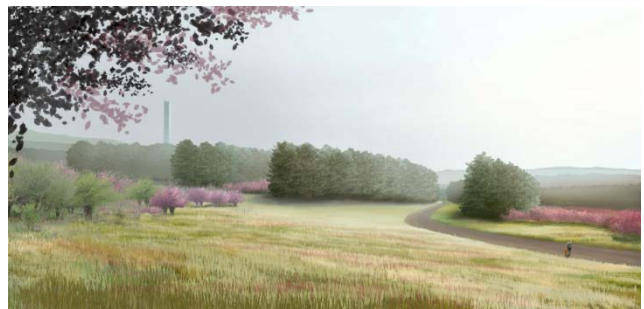
Future Tower of Voices as seen from the entrance to the Memorial. Paul Murdoch Architects

A 93-foot Tower of Voices will be built in the future. The Tower will serve as a landmark from the highway, marking the gateway to the park. Set among rings of trees, the Tower is planned to house 40 wind chimes that will serve as an enduring echo of the voices of the passengers and crew.