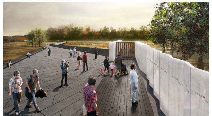
Artist's rendering of the Memorial Plaza at the crash site and Wall of Names, dedicated September 10, 2011. bioLINIA and Paul Murdoch Architects