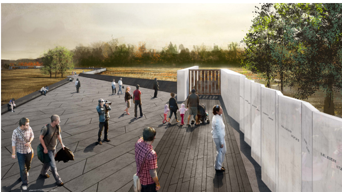
Artist's rendering of the Memorial Plaza at the crash site and Wall of Names, dedicated September 10, 2011.