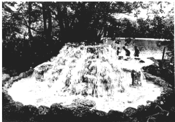
Grossman's original Artesian Well and Lake Chekika, June 1970

The artesian fountain in the picture surged at a rate of 3 million gallons a day. It required no electric pumps to make it flow. The original well's rate was constant throughout the day, with two exceptions. The first being the Alaskan earthquake in 1964. It was felt in Florida about 60 to 90 minutes after the first shock was recorded in Alaska, causing the well to produce 6 million gallons of water per day. The Grossman family reported that the waters overflowed and washed out the sandy beaches. The family had to enlarge the lake and replace the sand with material from the alligator hole. The second exception occurred in 1970 after an earthquake in California. This time the well produced 4 million gallons of water a day.