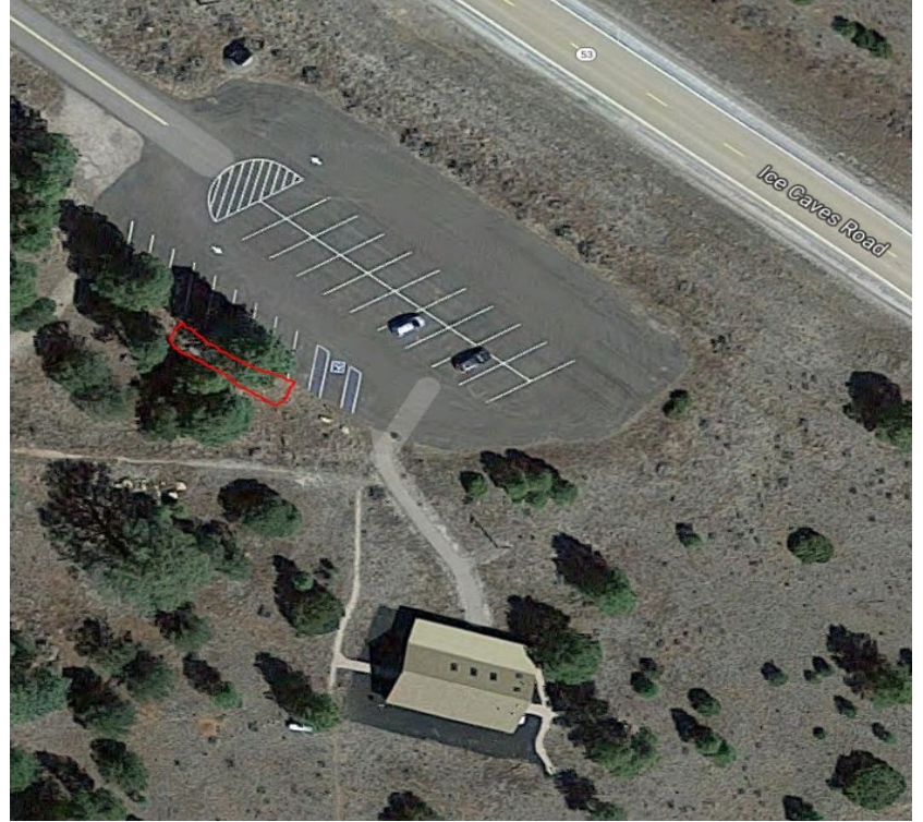
Figure 2. First Amendment location at the El Malpais Emergency Operations Center/Ranger Station Complex, circled in red.