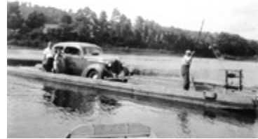
Dimmick's Ferry around 1923. The ferry used an underwater cable in low water and an overhead cable in high water.

Pennsylvania Department of Transportation paves the road and widens curves.