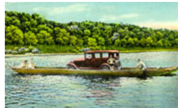
A postcard of Rosencrans Ferry.