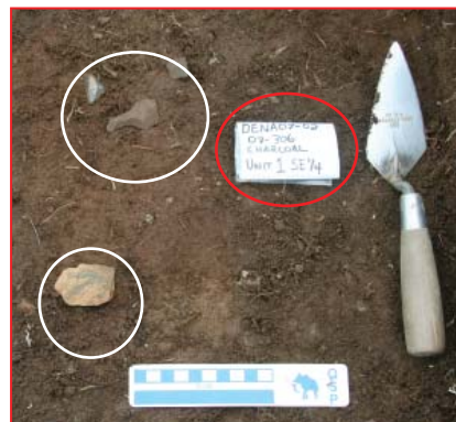
At Bull River, archeologists were able to estimate the age of the stone artifacts (circled in white) based on the radiocarbon analysis of a small charcoal cluster in close proximity to the artifacts (inside the packet circled in red).

Worldwide, archeologists continue to seek and accumulate physical evidence associated with the prehistoric peoples who successfully migrated and inhabited “new” continents during the last Ice Age. Perhaps the most contentious debate surrounds the nature and timing of the initial peopling of the Americas.