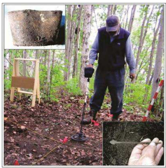
Metal arrow and primer can found at archeology site

Archeology and Geomorphology of Ancient Lake Minchumina: Two archeologists spent three weeks in the northwest corner of the park as part of the second year of a three year project to map the ancient shoreline of Lake Minchumina and explore the region for archeological sites.