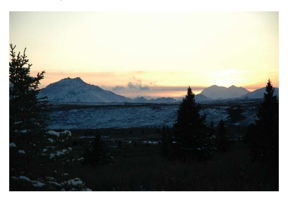
View of Mt. McKinley from Mountain Vista Rest Area

Due to interest in increased winter visitation opportunities, the park began the planning process to consider plowing the park road to the Mountain Vista Rest Area (Mile 12) during the winter months to provide additional recreational opportunities for winter visitors. The initial scoping for the took place in late February – early March. The draft alternatives were being developed and undergoing internal review throughout 2012. The draft alternatives were scheduled to be released for public comment in early 2013.