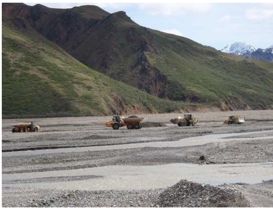
2012 Toklat "scrape", i.e. gravel removal operation

allows for minimum impact on the river system because it mimics natural river processes and form while providing a long-term sustainable gravel yield. Harvesting gravel locally minimizes traffic on the park road, use of fossil fuels, and the potential for invasive plants from external gravel sources. In 2012 the park completed a comprehensive analysis of the Toklat River system, which assessed cumulative impacts from bank reinforcement along the road system, the existing bridges and causeway, and gravel extraction. Additionally an annual re-survey of long-term cross sections used to monitor river dynamics was completed. One important conclusion of the comprehensive analysis is that both the infrastructure in the floodplain and gravel extraction activities are likely influencing channel pattern and river behavior. Alternatives are currently being explored to return the river to a more natural state, while continuing to provide gravel for the road and adequate land for necessary facilities.