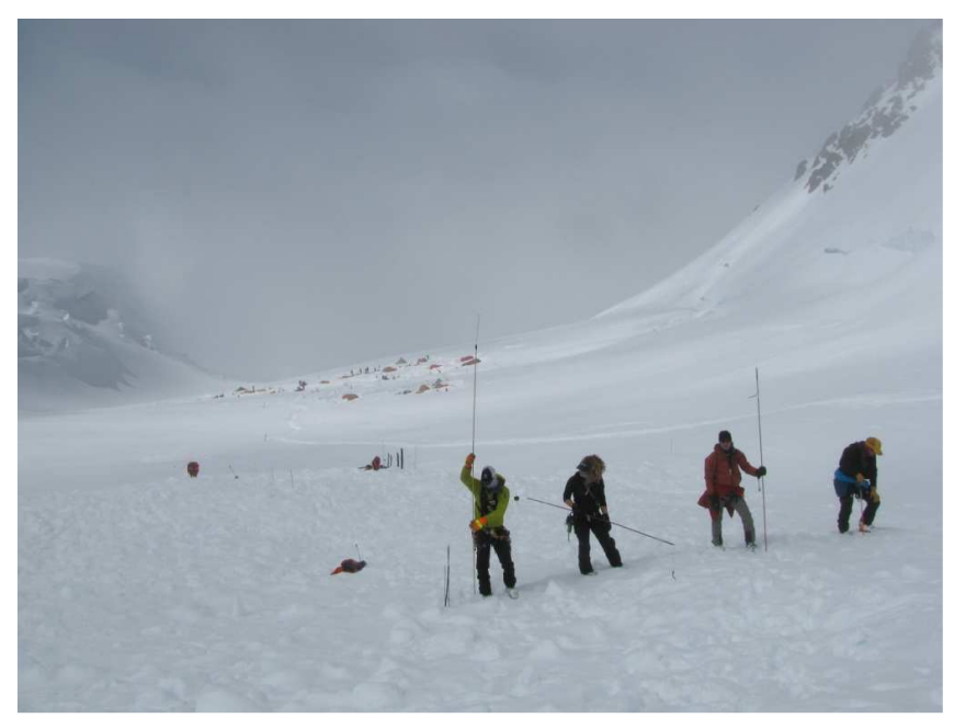
Probe line searching avalanche debris for clues to location of four Japanese climbers - June 16

The rescue season was another busy one, with 17 major incidents ranging from injured knees and ankles; to altitude-related illnesses such as HAPE and HACE; as well as multiple avalanches. Heavier than average snowfall resulted in an avalanche on Motorcycle Hill that claimed the lives of four Japanese teammates. One teammate survived the ordeal. In addition to those four fatalities, two other mountaineers died in unrelated falls on the West Buttress and on the Orient Express. South District staff also assisted Alaska's Rescue Coordination Center (RCC) by responding to three aircraft-related mishaps located in the Talkeetna Mountains, the southwest Preserve, and near Broad Pass.