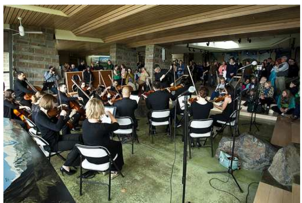
Fairbanks Summer Arts Festival Orchestra performing at Eielson Visitor Center