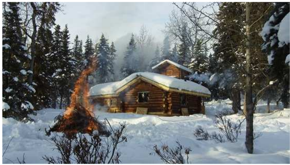
Debris from hazard fuel reduction project being burned at historic Parker Cabin

Denali had only two fires, the Glacier Creek Fire (285 acres) and the East Fork Toklat (4 acres). The large Bear Creek Fire (8795 acres) was just north of the park boundary. Fire management worked closely with interagency partners and the Alaska Eastern Area Fire Management group, to assist with fuels reduction projects at multiple Alaska parks, and support large fire incidents in the lower 48 states. Staff members served in a variety of positions including firefighter Type 2, helicopter crewmembers and helicopter managers.