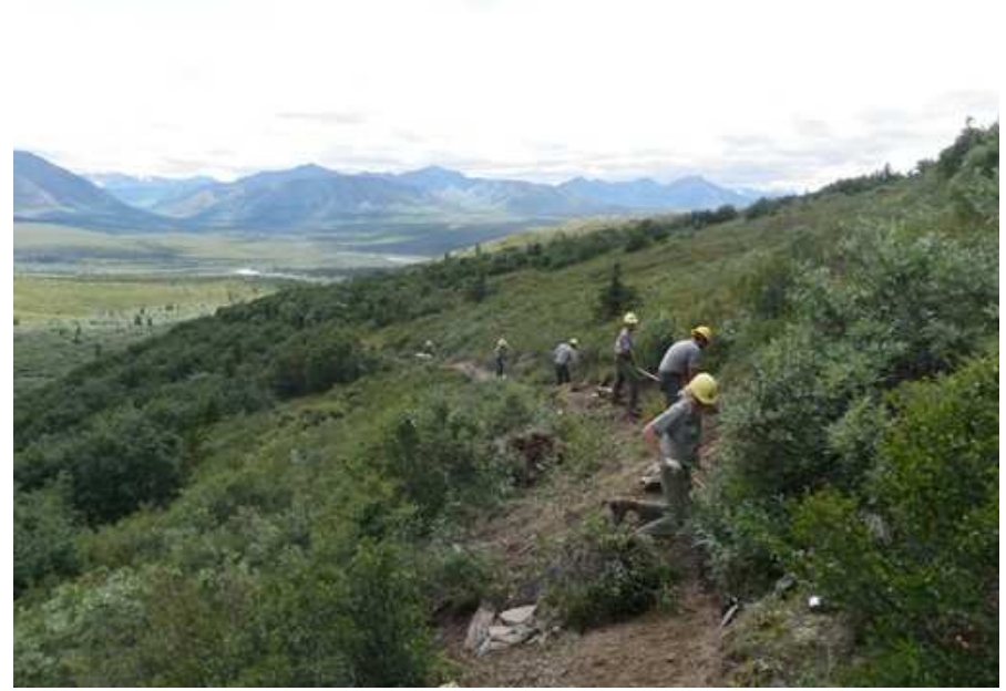
Trail crew working on Savage Alpine Trail

The trail crew also did a major rehabilitation on two miles of the Savage Canyon Loop trail, which included re-routing 1000 feet of the trail from the river edge. Over 100 volunteers, most of them local, came to assist with the trail work. The crew also rehabilitated the entire surface of the Horseshoe Lake trail, and installed 350 log checks to combat erosion.