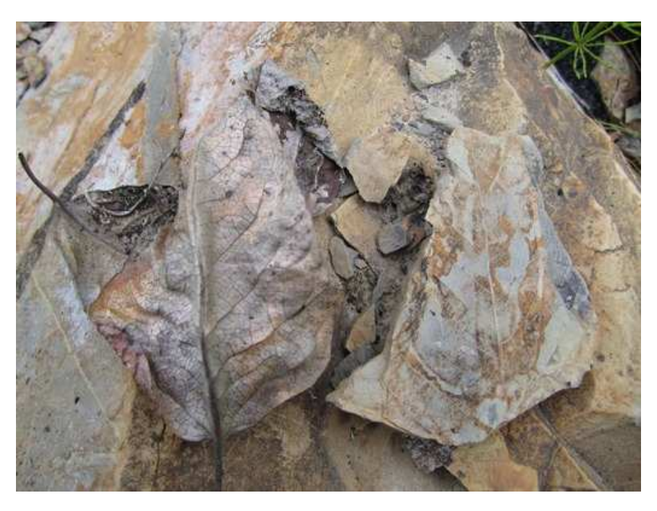
Recently fallen leaf on the left pictured with leaf fossil on the right

The multi-year Paleontological Resources Inventory Project determined the location, condition, and significance of 21 new fossil resources within the Late Cretaceous Cantwell formation of the park. At the close of the field season, 213 fossil localities containing 420 distinct specimens have been documented.