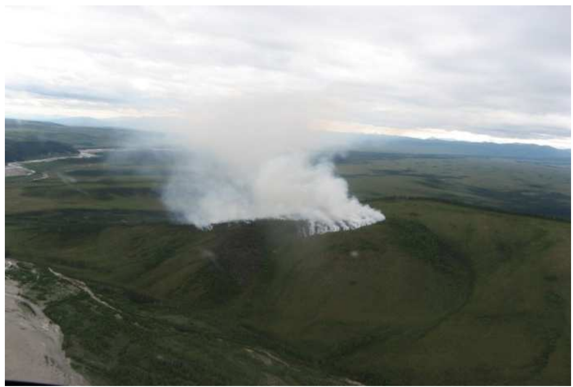
Chitsia Mountain Fire, July 10