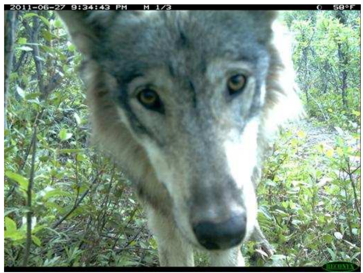
Wolf image captured on camera "trap'