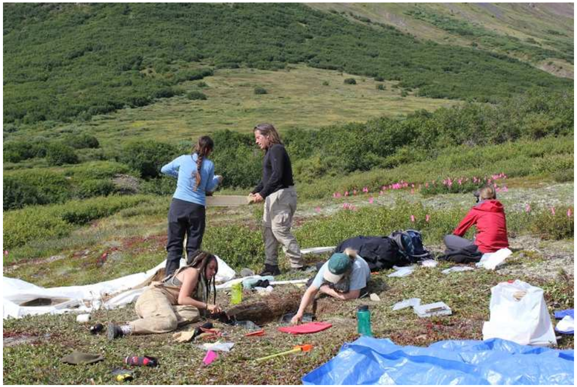
Cultural resources staff and volunteers at Upper Windy site