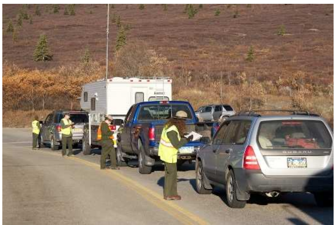
Entrance station staff orienting road lottery permittees at Savage River Check Station

The park received 11,204 entries, with the majority, 9856, done on-line. A breakdown of who applies for the lottery revealed that 87% are Alaskans, over 12% are U.S. residents from outside Alaska, and less than 1% are non-U.S. residents.