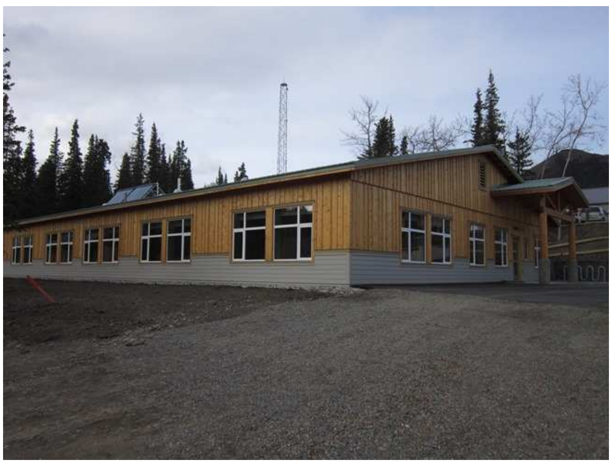
Cale Shaffer Building

The emergency services facilities (main building and the storage annex) were completed in Fall 2011. The newly named "Cale Shaffer Building" will house the park and regional communication center and workspace for ranger and fire management staff. Shaffer was a seasonal mountaineering ranger who died in June 2000 when the plane carrying him, two mountaineering volunteers, and the pilot crashed enroute to Base Camp. The annex building, which will provide heated parking for multiple emergency vehicles and storage for emergency equipment, has been named the "Over and Out". The Cale Shaffer Building was designed and constructed for Silver LEED eligibility – certification is pending.