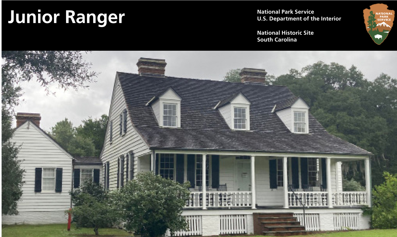
Complete the following activities and share something you learned about today with a Park Ranger or Volunteer to earn your official Charles Pinckney National Historic Site Junior Ranger badge! By exploring the grounds, watching the movie, and viewing exhibits you'll learn more about this "forgotten founder" and important 18th century history.