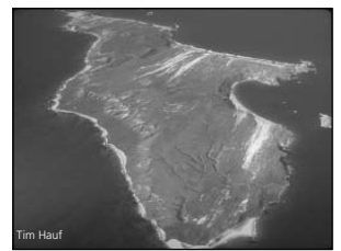
San Miguel Island in 1930 when non-native animals overgrazed the island, reducing it to "a barren lump of sand." (top left). San Miguel in January 2000. Just 30 years after the removal of non-native animals, vegetation has returned and started to stabilize the island (top right). San Miguel's native vegetation as it appears today above Cuyler Harbor (left).