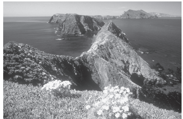
Inspiration Point