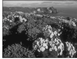
San Miguel Island in 1930 when non-native animals overgrazed the island, reducing it to "a barren lump of sand." (top left). San Miguel in January 2000. Just 30 years after the removal of non-native animals, vegetation has returned and started to stabilize the island (top right). San Miguel's native vegetation as it appears today above Cuyler Harbor (left).

This multi-year program to remove golden eagles, reintroduce bald eagles, breed island foxes, eradicate pigs, and control fennel will help restore the balance to Santa Cruz Island's naturally functioning ecosystem. Once restored, the island will offer one of the last opportunities to experience the nationally significant natural and cultural heritage of coastal southern California.