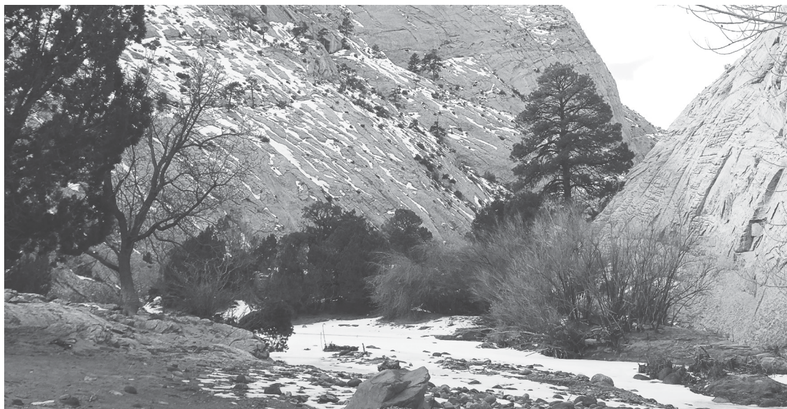
Oak Creek Canyon in the winter.

Capitol Reef species lists are available at the visitor center information desk and online ( www.nps.gov/care ). Utah sensitive species lists are available from the Utah Division of Wildlife and State Natural Heritage Program. Statistics for this bulletin are drawn from IRMA.nps.gov, the NPS's Northern Colorado Plateau Network, and the Western Regional Climate Center.