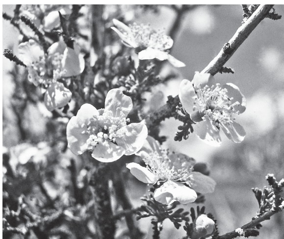
Cliffrose blooming in the desert.

Much of Capitol Reef's life is concentrated near these canyon water sources. Listen quietly for birdsong and the rustle of deer coming to drink. Imagine it is night, with bats swarming above the water, using echolocation to find their insect prey. Many predators have co-evolved with their prey, so nocturnal prey species have predator species that are active at night, as well.