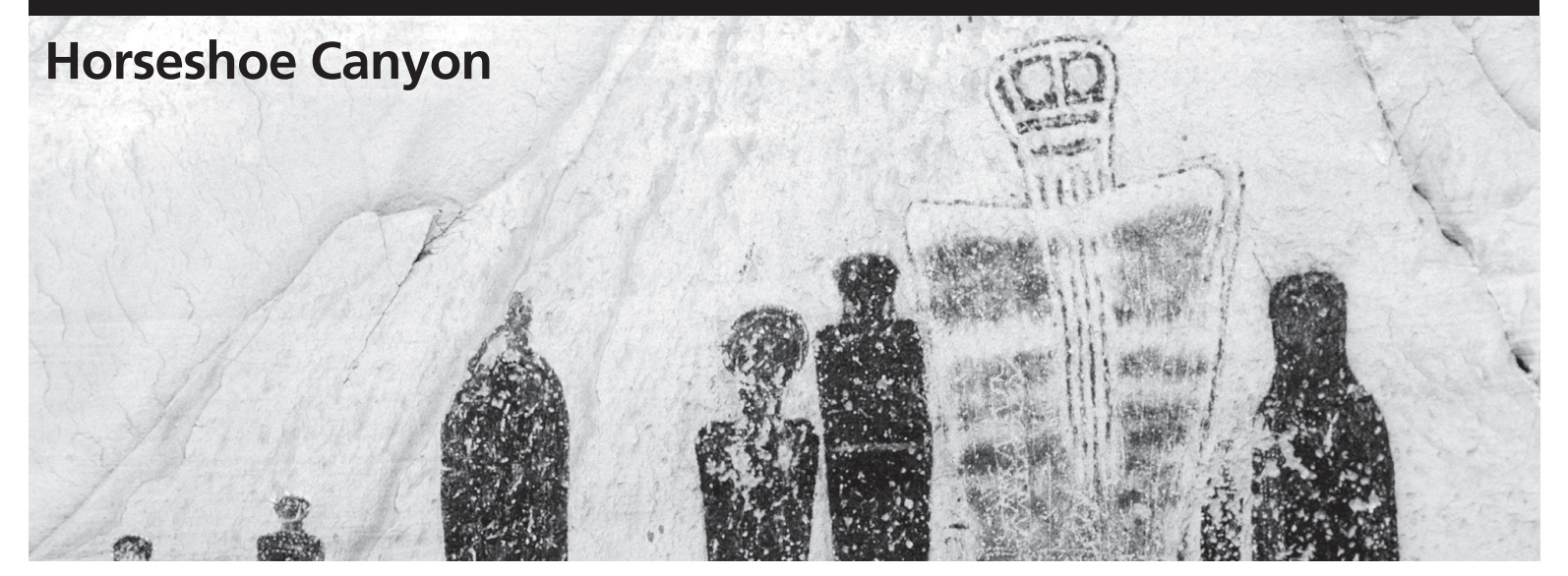
Horseshoe Canyon contains some of the most significant archaic rock art in North America. Other impressive sights include spring wildflower displays, sheer sandstone walls, and mature cottonwood trees which shade the canyon floor.