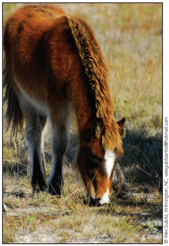
Young horses need thick winter coats and enough grasses left over from the growing season to survive the cold months.

By making the best possible decisions, this wild but remotely managed population will have the genetic diversity to adapt to its changing barrier island ecosystem