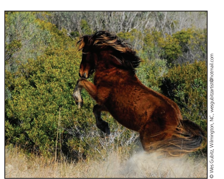
Strength and agility are required of a successful harem stallion.

Management decisions of contraception and removal are made on the basis of number of representatives, mean kinship, and some individual factors. For example, a mare with one "uncle" and no offspring would not be contracepted so she has the chance to produce offspring for her line. A stallion with no offspring and no known relatives would – if he could win and keep a mare – have the chance to increase his line by having any foals stay on the island – even if their