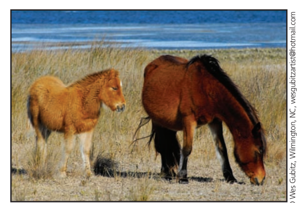
Management strategy allows mares of under-represented lines the chance to reproduce.

If the horses weren't managed, natural selection would determine which animals reproduced. Females who were fertile and who were good mothers would have offspring.