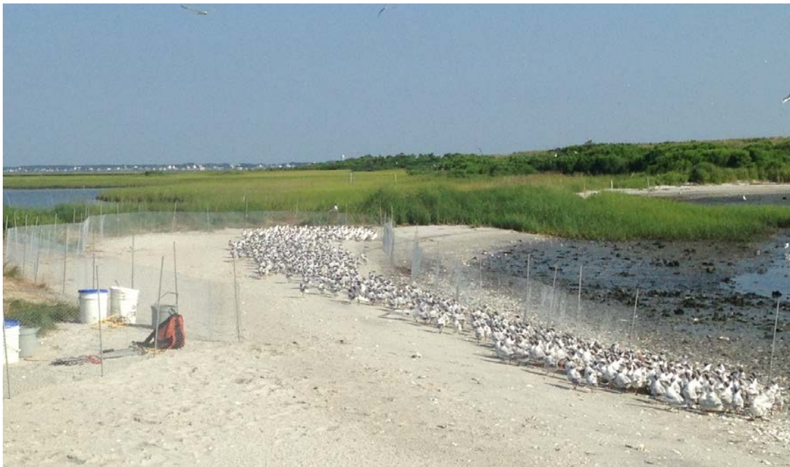
Royal and sandwich tern chicks corralled for banding on Morgan Island.