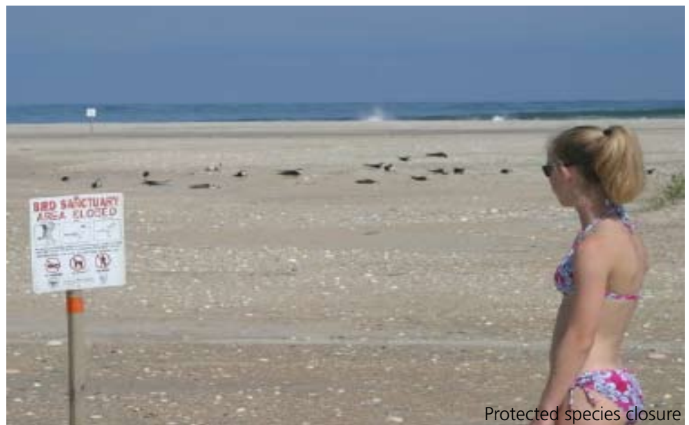
Protected species closure

The negotiated rulemaking advisory committee was established to assist the National Park Service in preparing an ORV management plan and special regulation for Cape Hatteras National Seashore. The committee held its final meeting in late February 2009 after meeting for 14 months. The committee provided a considerable amount of useful information on ORV management options for NPS to consider, however the committee did not reach agreement on a consensus alternative. As a result, NPS considered the committee's input in developing the ORV management plan, and the draft environmental impact statement (DEIS) was released for public comment in March 2010.