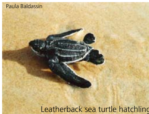
Leatherback sea turtle hatchling