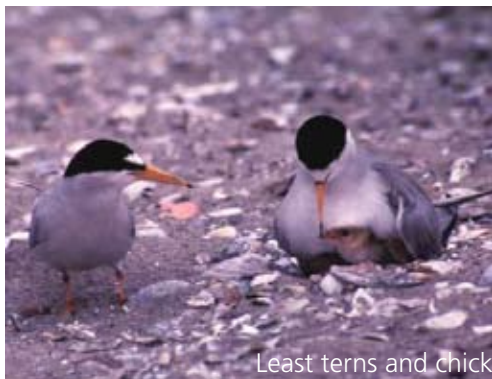
Least terns and chick

For general information on beach access, call 252-473-2111 x148.