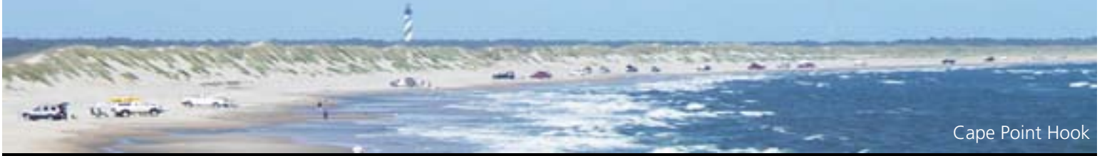
Cape Point Hook