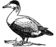
Eider (2 ft. long)

WALK: WINTER BIRD WONDERLAND - 10 AM Up to 2 hours, 1½ miles (weather dependent). Free. In addition to hosting our year-round resident birds, Cape Cod becomes a balmy (relatively speaking) southern destination for birds looking for warmer weather and open water. Meet in the parking area at the Salt Pond Visitor Center, Eastham. Bring binoculars if you have them; we will also have a few to loan.