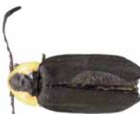
9mm Black firefly Lucidota atra