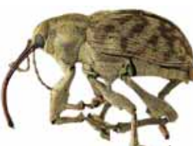
8mm Acorn weevil Curculio pardalis