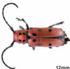
12mm Red milkweed beetle Tetraopes tetropthalmus