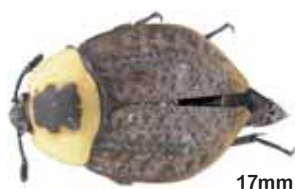
17mm American carrion beetle Necrophila americana