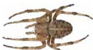
13mm European garden spider* Araneus diadematus