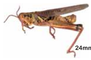
24mm Red-legged grasshopper Melanoplus femurrubrum