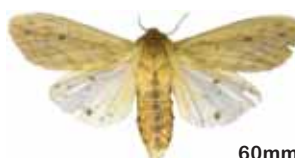
Isabella tiger moth Pyrrharctia isabella 60mm