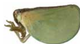
5mm Two-lined planthopper Acanalonia bivittata