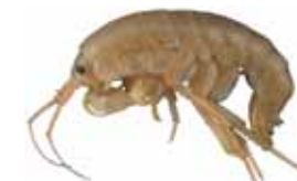
17mm Beach hopper Orchestia grillus