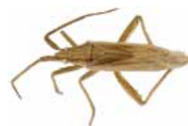
7mm Plant bug Stenodema trispinosa