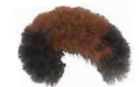
Woolly bear caterpillar up to 55mm