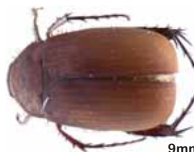
9mm Asiatic garden beetle* Maladera castanea