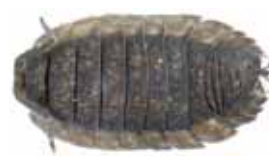
17mm Common rough woodlouse* Porcellio scaber