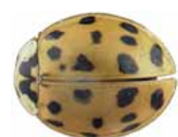
6mm Multi-colored Asian lady beetle* Harmonia axyridis