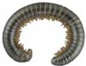
24mm Julid millipede* Cylindroiulus caeruleocinctus