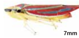
7mm Candy-striped leafhopper Graphocephala coccinea