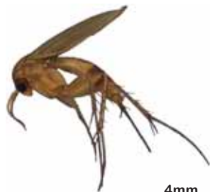
Fungus gnat Mycetophila fisherae 4mm