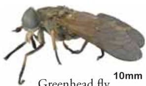
Greenhead fly Tabanus nigrovittatus 10mm