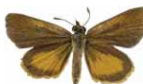
Least skipper Ancyloxypha numitor 24mm