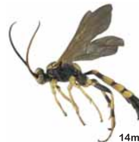
Ichneumonid wasp Ichneumon annulatorius 14mm