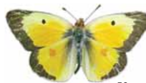
Orange sulphur butterfly Colias eurytheme 50mm