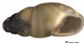
Glossy pillar snail Cochlicopa lubrica 6mm