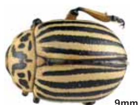
9mm Colorado potato beetle* Leptinotarsa decemlineata