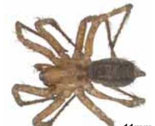
11mm Funnel web spider Agelenopsis potteri