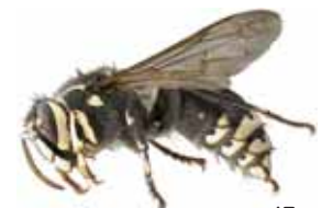
Bald-faced hornet Dolichovespula maculata 17mm