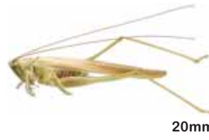
20mm Slender meadow katydid Conocephalus fasciatus