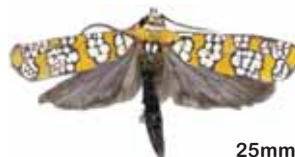
Ailanthus webworm Atteva punctella 25mm