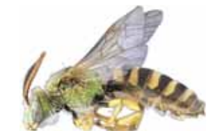
Sweat bee Agapostemon virescens 11mm