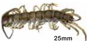
25mm Brown centipede* Lithobius forficatus