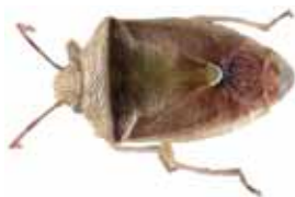
9mm Banasa stink bug Banasa dimidiata