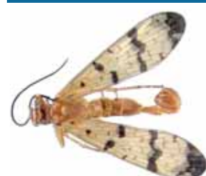
11mm Common scorpionfly Panorpa rufescens