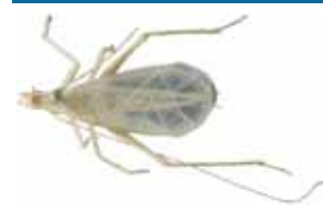
15mm Snowy tree cricket Oecanthus fultoni