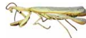
55mm European mantis* Mantis religiosa