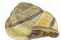
Brown-lipped snail* Cepaea nemoralis 22mm