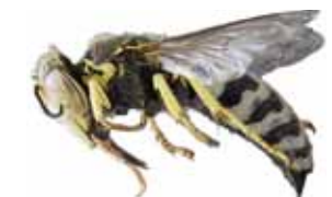
Sand wasp Bembix americana 15mm