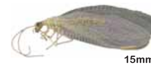
15mm Golden-eyed lacewing Chrysopa oculata