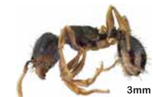
Pavement ant* Tetramorium caespitum 3mm