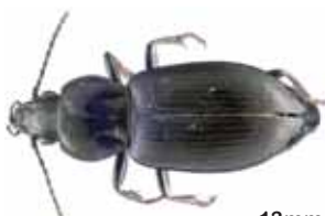
13mm Ground beetle Pterostichus mutus