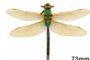
73mm Common green darner Anax junius