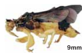
9mm Ambush bug Phymata pennsylvanica