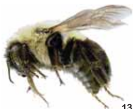
Common Eastern bumble bee Bombus impatiens 13mm