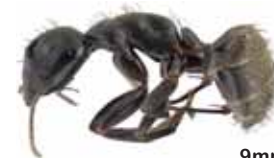
Carpenter ant Camponotus pennsylvanicus 9mm