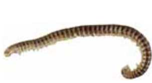
13mm Beach millipede Thalassiosobates littoralis