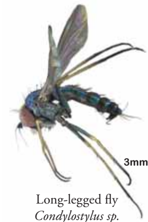
Long-legged fly Condylostylus sp. 3mm