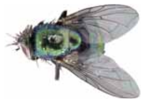
Common green bottle fly Lucilia sericata 9mm