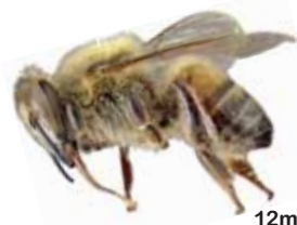
Honey bee* Apis mellifera 12mm