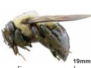
Eastern carpenter bee Xylocopa virginica 19mm