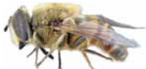
Drone fly Eristalis tenax 13mm