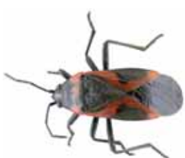
11mm Small milkweed bug Lygaeus kalmii