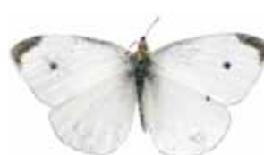
Cabbage white butterfly* Pieris rapae 43mm