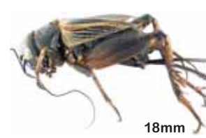
18mm Fall field cricket Gryllus pennsylvanicus