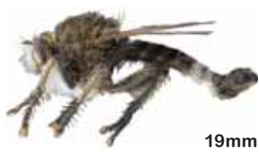
Robber fly Albibarbefferia albibarbis 19mm