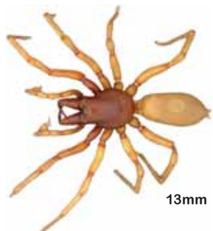
13mm Woodlouse hunter* Dysdera crocata