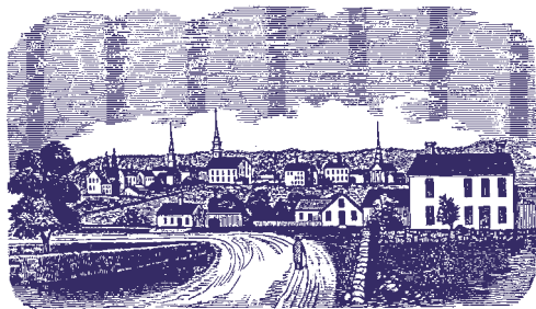
Grafton Center, from South Street, in 1839.

A lack of waterpower at Grafton Center allowed the center to develop into what it is today. Grafton investors built mills on the Blackstone and Quinsigamond rivers, creating new village centers in Fisherville, Farnumsville, Saundersville, Kittville, Centerville and New England Village. Each of these villages has its own fascinating story to tell, but it is also important to recognize how