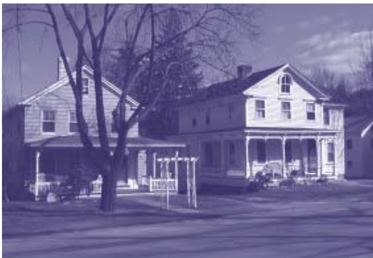
The handsome "50¢ houses" along the East Side of South Street, once the site of shoe mills and worker tenements, stand in stark contrast to the grandeur of the mill owner homes located across the street.

As you look down South Street, the economics of the leather industry can be readily seen. To your right on the west side of the street stand the impressive homes of many of the boot shop owners. Across the street to the east are many of the old shops, now converted to housing, along with the tenements that housed the workers. Locals often speak of these as the "dollar houses and the 50¢ houses."