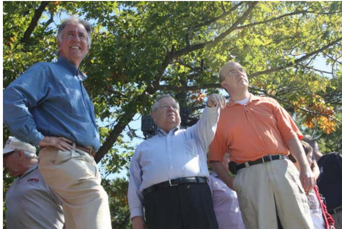
Congressman Richard E. Neal, Senator Richard T. Moore and Congressman James McGovern at Lookout Rock in Northbridge yesterday in support of legislation to make the Blackstone River Valley a national park.