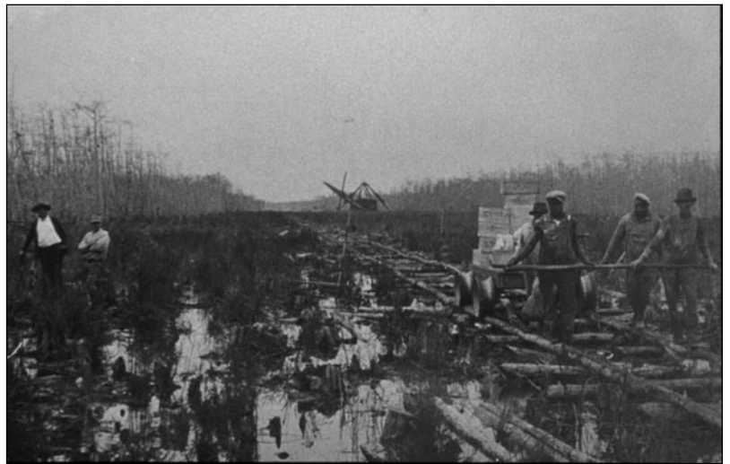
Laying a railroad track into the heart of the swamp.

came up with a theory that the deer were carrying a tick that infected the cattle, so they paid a bounty for hunters to kill the deer. They decimated the deer population, until they found out that there was no truth to it. I think they just did not want the deer competing for range grass. My father killed 30 something in one day for the bounty. It was a mass slaughter of deer. There was some wild turkey and they probably got some when they could. They fished, whenever they could in canals. But, I've cut some logs myself when I was about 15, and at end of a day working hard pine and lighter post for fence for like 16 hours with