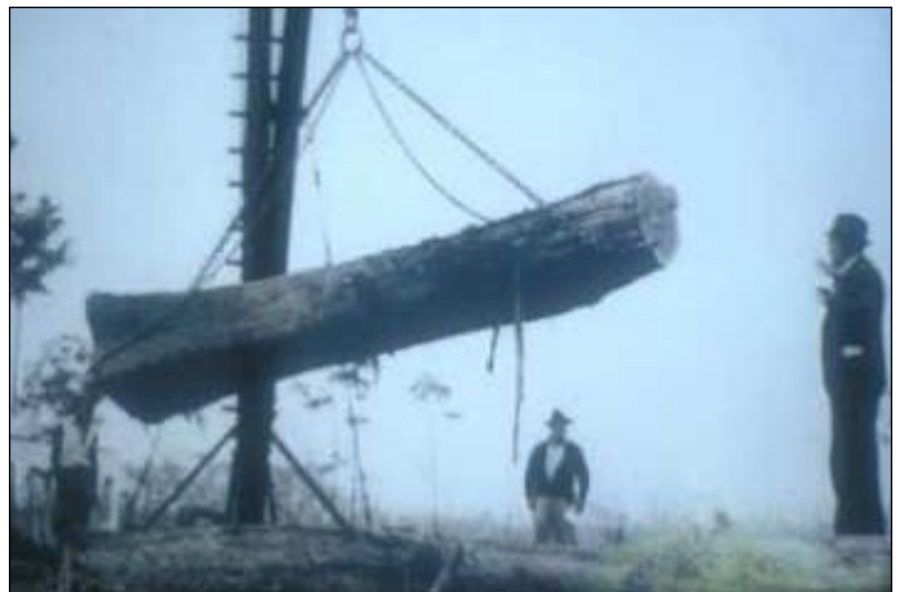
Using a boom to move a cut log.

They was payin’ us $100 a week. You’d make that and sometimes more. That was in 1949 to 1955. That was a lot of money back them days.