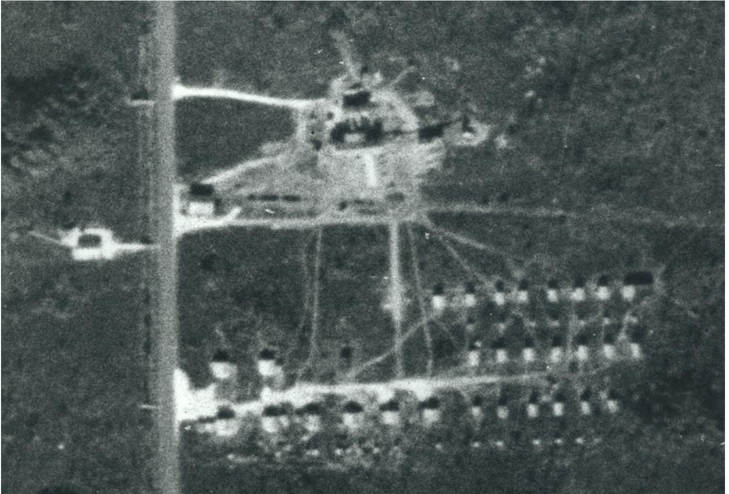
An aerial view of the Reynold's Sawmill operation within Big Cypress.

At the sawmill of the C. J. Jones Company at Jerome, logs were milled into lumber after the trees were cut. This operation involved mostly the cutting of pine and other softwoods, on the higher pinelands. This was the more traditional type operation that deforested much of the woods of the South Eastern states. Indeed, the Jones Company was an outgrowth of the trend of such operations to move southward as the forests in Georgia, Alabama, and South Carolina were no longer productive. A majority of the African American loggers were originally from Alabama, Georgia and North Florida.