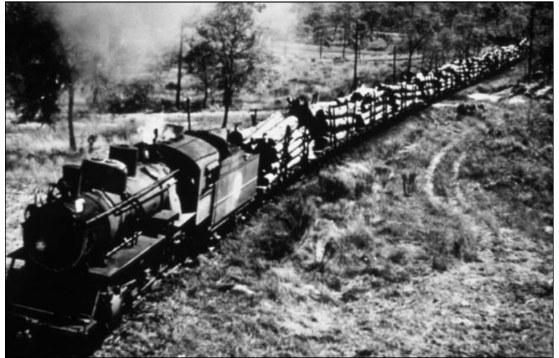
During the peak of the logging operations several full trains were heading north. The "wood eternal" would be used for pickle barrels, stadium seats and to build PT Boats during WW II.

During the height of the cypress logging the community was burgeoning with people. Many single men lived in a boarding house and ate their meals there. Families rented in one of the company cabins. In the early logging period the loggers worked 5 days per week but, as the demand for cypress grew while at the same time pressure mounted to preserve what was left of the ancient trees, the logging pace quickened. The advent of the power saw increased the pace even more and workers began working seven days per week. When logging of the cypress began in earnest in the 40's it was predicted that it would take 40 to 50 years to exhaust the cypress. With the coming of the power saw, it took less than two decades.