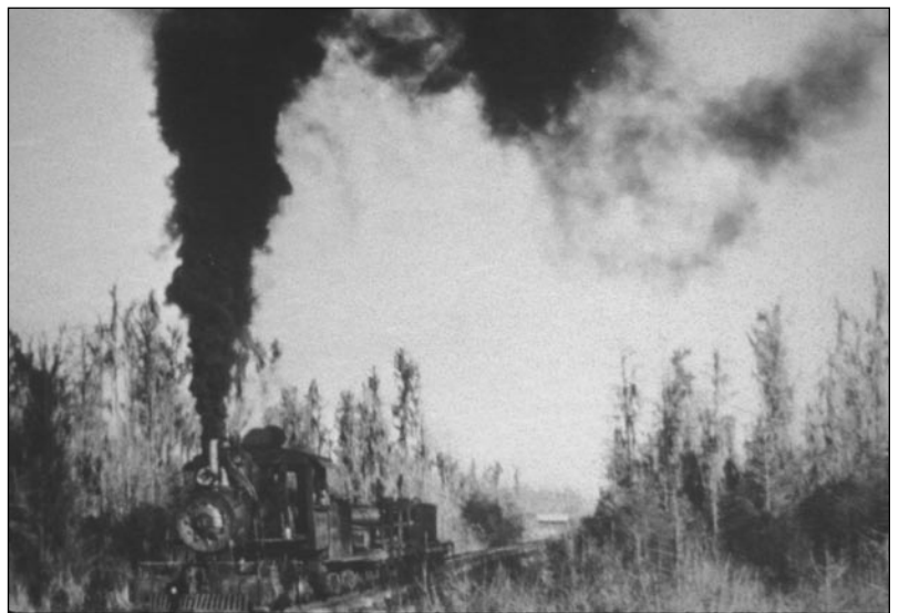
Narrow gauge trains were instrumental in hauling cut timber out of the swamp. Eventually 35+ miles of track were laid. The cut lumber was hauled to the north using rail as well.