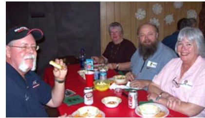
Good Company Good Food Great Awards!