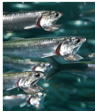
Scene from the Monterey Aquarium. (I really put this photo in so that we could look at something wet.)

I have the utmost respect for volunteers. These individuals are so passionate about the missions of our respective organizations as to donate their time and energy to support us. Time is perhaps the most valuable resource each of us has, and I consider it the supreme compliment when someone donates their time. The passion that volunteers bring is also a vital ingredient in effective interpretation, and they provide it in abundance to share with our guests.