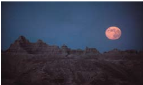
Badlands at night