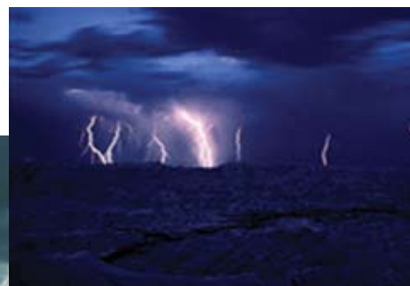
Lightning storm