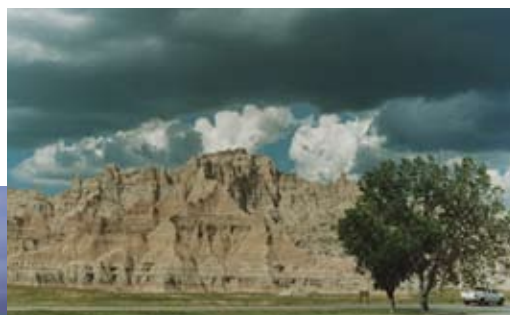
Storm clouds