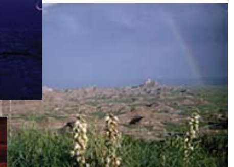
After a rainstorm