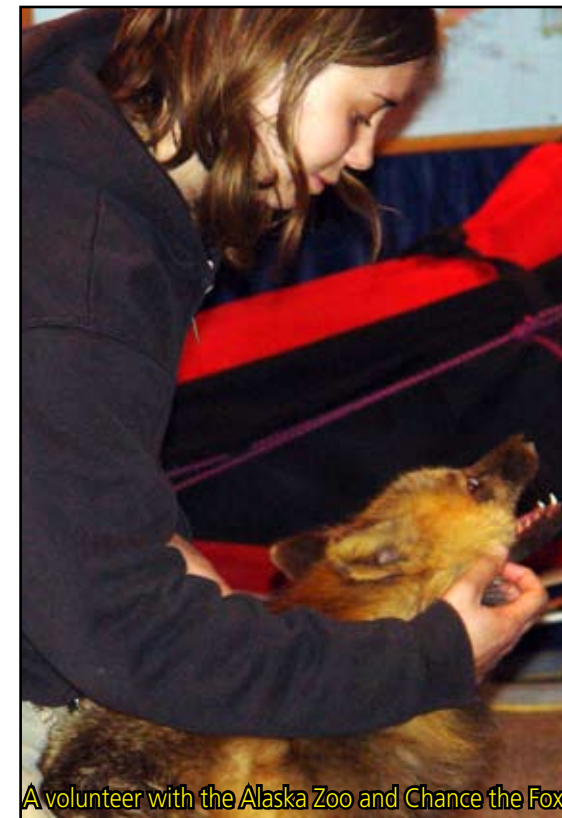
A volunteer with the Alaska Zoo and Chance the Fox